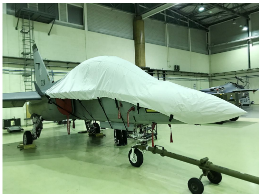
Alenia Aermacchi M-346 Canopy/Nose Cover

This cover type is made from Silver Acrylic Sunbrella canvas and is 100% lined with a soft and smooth microfiber. Bruce's Custom Covers developed this material combination especially for aircraft protection. The outer material is medium weight and treated for water resistance, UV resistance and anti-static buildup. The inner lining is a very soft and smooth microfiber to prevent scratching. The material is very reflective, and tests show that the cabin interior temperature can be reduced to near-ambient temperature on the hottest of days. It is water, ice and snow repellent, yet breathable to allow moisture to escape from between the cover and the aircraft surface.