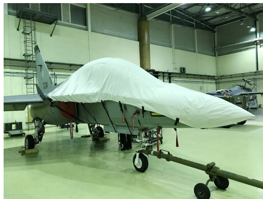
Alenia Aermacchi M-346 Canopy/Nose Cover