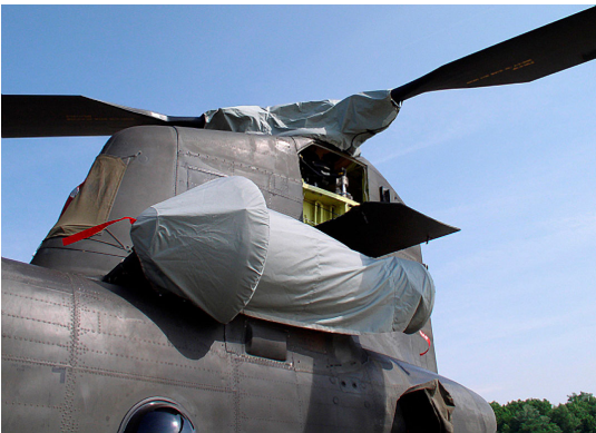
Boeing Vertol CH-47 Engine and Rotor Hub Covers

Insulated Covers Material - A special composite material of solution-dyed polyester, 3M Thinsulate insulation, and soft nylon interior fabric. Our insulated covers are designed to complement an engine preheater and help retain heat in the engine compartment after shutdown. If you operate your aircraft in cold-weather, these covers will help prevent engine wear and tear.