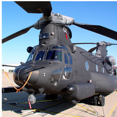
Boeing Vertol MH-47 Rotor Hubs, Engine & Other Covers