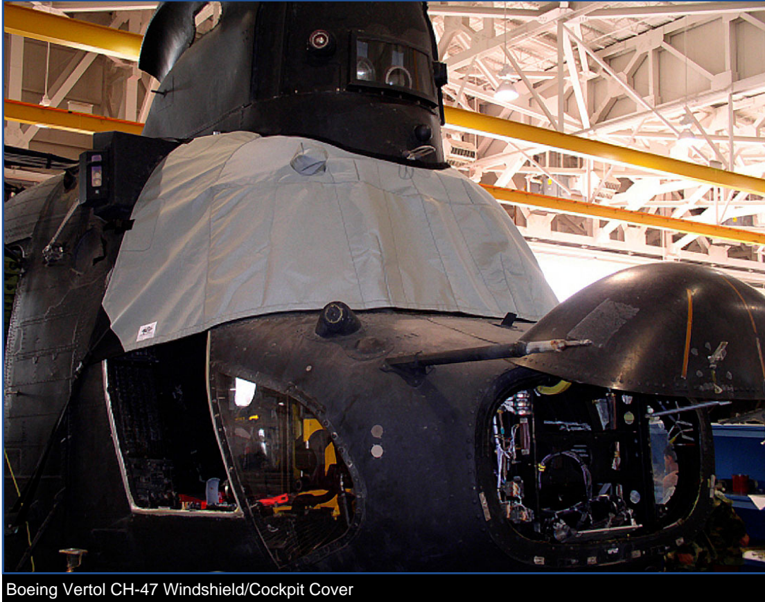
Boeing Vertol CH-47 Windshield/Cockpit Cover