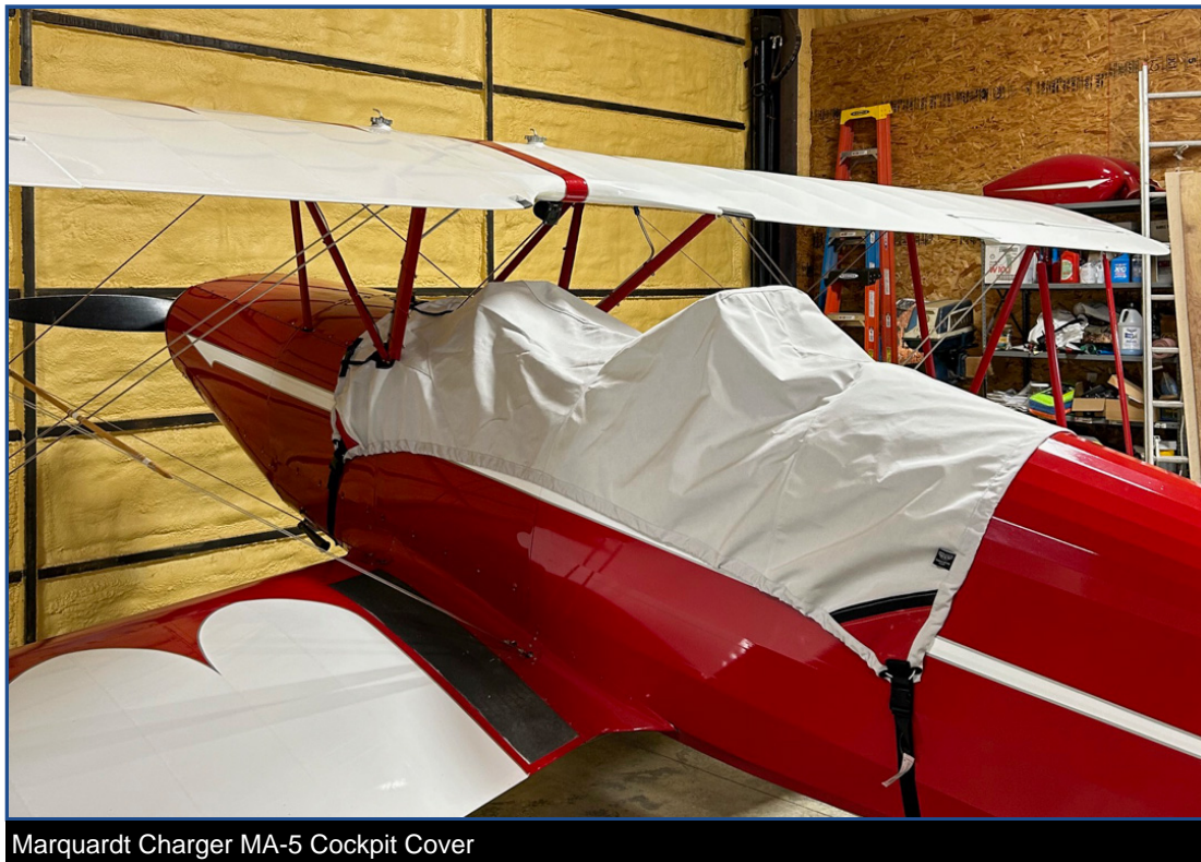
Marquardt Charger MA-5 Cockpit Cover