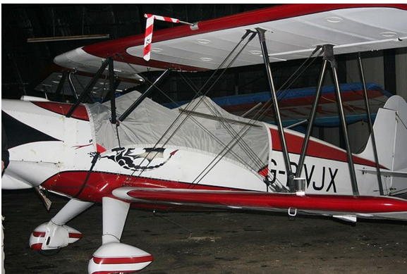
Marquardt Charger MA-5 Light Weight Travel Cockpit Cover

This cover type is made from Silver Acrylic Sunbrella canvas and is 100% lined with a soft and smooth microfiber. Bruce's Custom Covers developed this material combination especially for aircraft protection. The outer material is medium weight and treated for water resistance, UV resistance and anti-static buildup. The inner lining is a very soft and smooth microfiber to prevent scratching. The material is very reflective, and tests show that the cabin interior temperature can be reduced to near-ambient temperature on the hottest of days. It is water, ice and snow repellent, yet breathable to allow moisture to escape from between the cover and the aircraft surface.