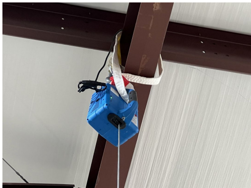
Stearman PT-13 Full Body Dust Cover, Remote Control Winch

Some high value aircraft end up logging lots of hangar time, and become dust magnets in the process. A high quality, well fitting dust cover provides easy assurance that the aircraft's surfaces remain clean and free of grit and grime. Available in a large variety of colors, each dust cover is custom made according to aircraft details and customer preferences. Fire retardant fabrics are also available.