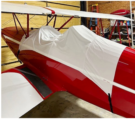
Marquardt Charger MA-5 Cockpit Cover