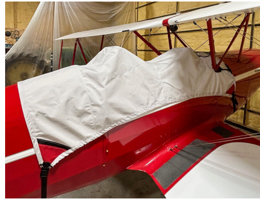
Marquardt Charger MA-5 Cockpit Cover