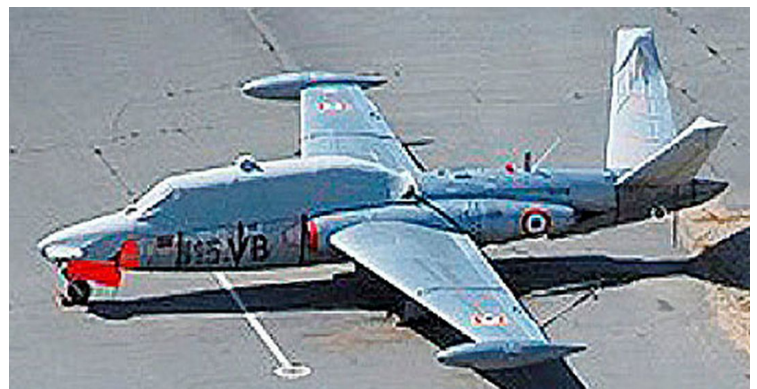
Fouga Magister Canopy/Nose Cover, Tail Stabilizer Covers