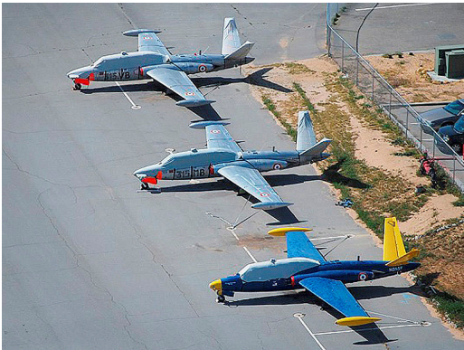
Fouga Magister Canopy Cover, Canopy/Nose Covers and Tail Stabilizer Covers

This cover type is made from Silver Acrylic Sunbrella canvas and is 100% lined with a soft and smooth microfiber. Bruce's Custom Covers developed this material combination especially for aircraft protection. The outer material is medium weight and treated for water resistance, UV resistance and anti-static buildup. The inner lining is a very soft and smooth microfiber to prevent scratching. The material is very reflective, and tests show that the cabin interior temperature can be reduced to near-ambient temperature on the hottest of days. It is water, ice and snow repellent, yet breathable to allow moisture to escape from between the cover and the aircraft surface.