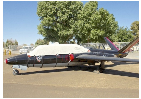
Fouga Magister Canopy/Nose Cover with nose mount loop antenna