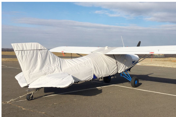
Maule M-5-235C Extended Canopy Cover, Empennage Cover