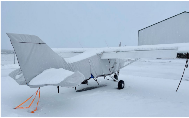
Maule MX7-180 Extended Canopy Cover, Engine, Prop & Empennage Covers.