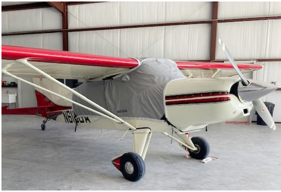
Maule M5-180C Travel Weight Canopy Cover