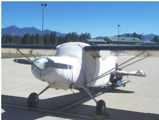
Maule MX7-180 Prop, Engine, Extended Canopy & Empennage Covers Maule M7-180 Full Body Over-Top Fuselage/Tail Cover