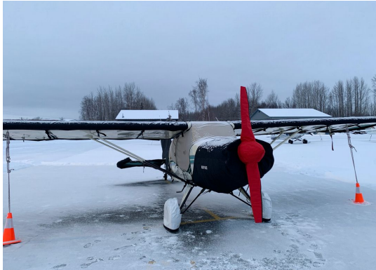
Maule M7-180 Insulated Engine & Prop Covers, Wing Covers

This cover type is made from Silver Acrylic Sunbrella canvas and is 100% lined with a soft and smooth microfiber. Bruce's Custom Covers developed this material combination especially for aircraft protection. The outer material is medium weight and treated for water resistance, UV resistance and anti-static buildup. The inner lining is a very soft and smooth microfiber to prevent scratching. The material is very reflective, and tests show that the cabin interior temperature can be reduced to near-ambient temperature on the hottest of days. It is water, ice and snow repellent, yet breathable to allow moisture to escape from between the cover and the aircraft surface.