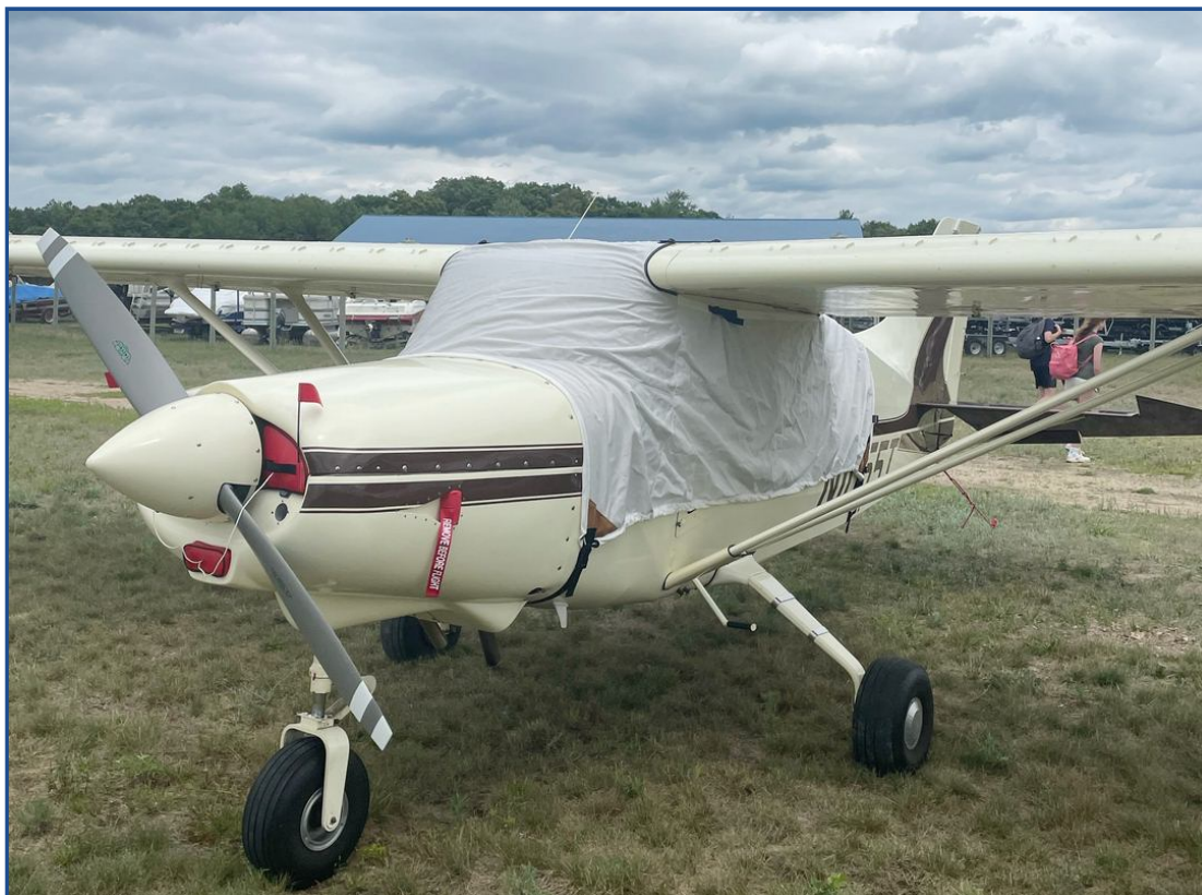
Maule MXT-7-180A Canopy Cover, Engine Plugs