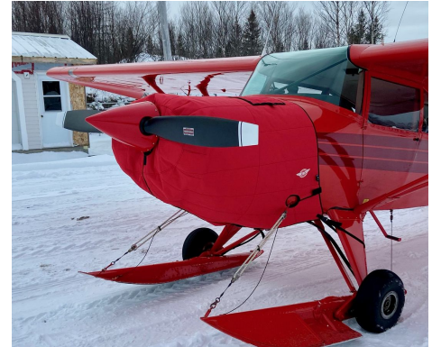
Maule M5 Insulated Engine Cover