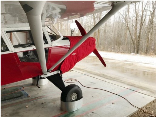
Maule M4-220C Insulated Engine Cover

This cover type is made from Silver Acrylic Sunbrella canvas and is 100% lined with a soft and smooth microfiber. Bruce's Custom Covers developed this material combination especially for aircraft protection. The outer material is medium weight and treated for water resistance, UV resistance and anti-static buildup. The inner lining is a very soft and smooth microfiber to prevent scratching. The material is very reflective, and tests show that the cabin interior temperature can be reduced to near-ambient temperature on the hottest of days. It is water, ice and snow repellent, yet breathable to allow moisture to escape from between the cover and the aircraft surface.