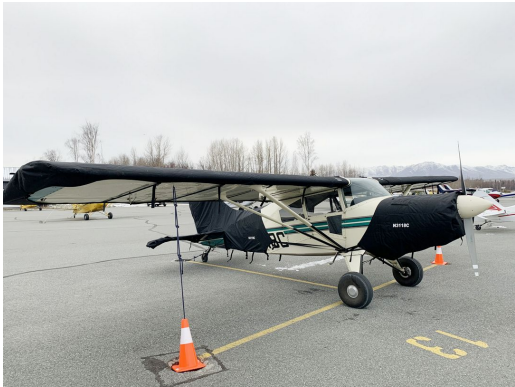
Maule Insulated Engine Cover, Wing & Empennage Covers