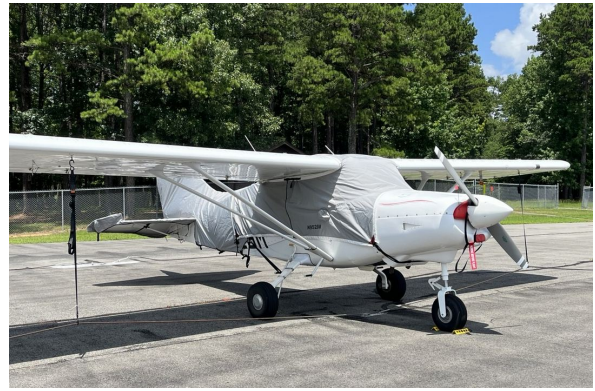
Maule MXT-7-180 Canopy & Empennage Covers, travel weight