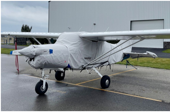
Maule MX7-180 Prop, Engine, Extended Canopy & Empennage Covers