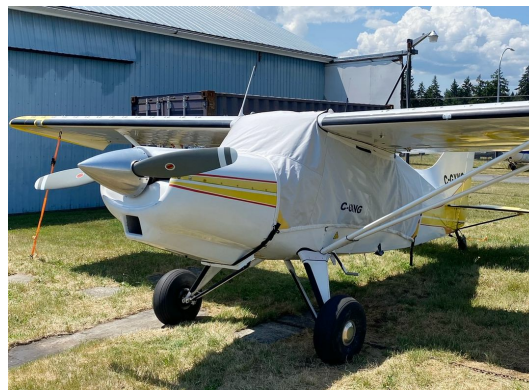
Maule M5-235C Canopy Cover, wrap around type