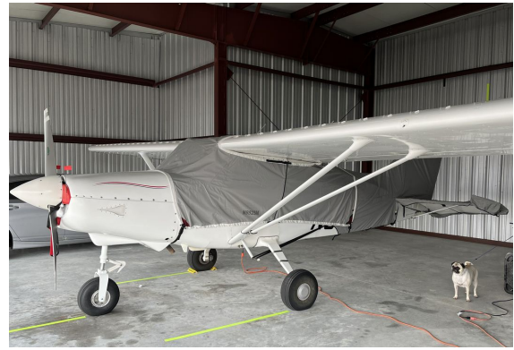
Maule MXT-7-180 Canopy & Empennage Covers, travel weight