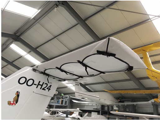
Dynaero MCR Horizontal Stabilizer Cover

WINTER USE MATERIAL - Made with Solution-Dyed Polyester fabric, this option is intended for seasonal use to aid in deicing, rain mitigation, or for occasional travel. The material is lighter and more compact, but more susceptible to UV damage and may have a shorter useful life if used continuously outside than the all-year use material.