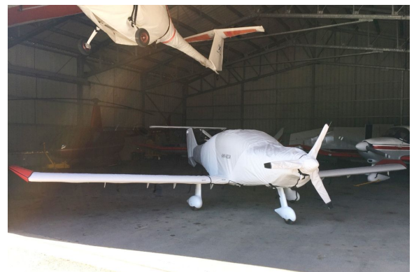
Dynaero MCR.4 Pickup Complete Cover Set.