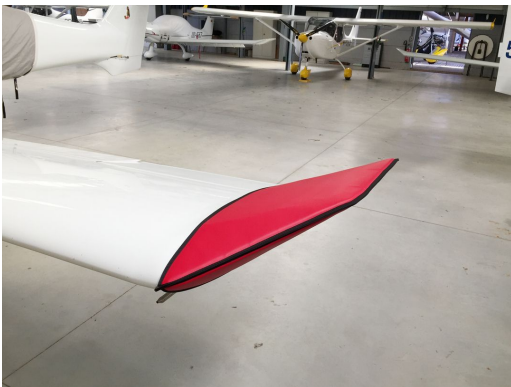
Dynaero MCR Pickup Wingtip Pads

Designed to prevent damage to the aircraft extremities in crowded hangars, these products are made of bright red Naugahyde and thickly padded with a sandwich of closed cell foam.