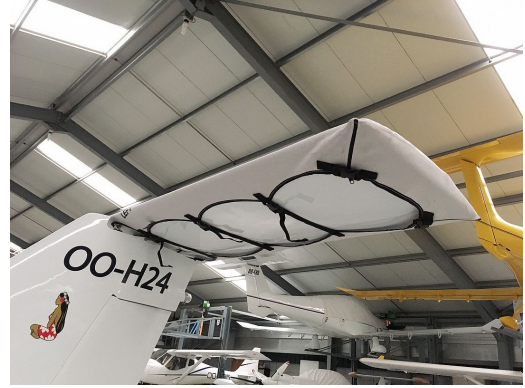
Dynaero MCR Horizontal Stabilizer Cover