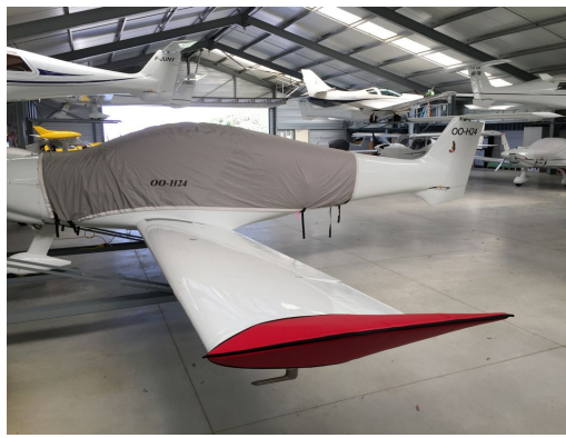
Dynaero MCR.4 Pickup Canopy Cover, Wingtip Pads