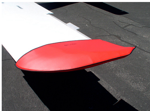
Cessna 350/400 Wingtip Pads

Designed to prevent damage to the aircraft extremities in crowded hangars, these products are made of bright red Naugahyde and thickly padded with a sandwich of closed cell foam.