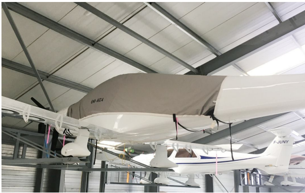
Dynaero MCR.4 Pickup Canopy Cover

This cover type is made from Silver Acrylic Sunbrella canvas and is 100% lined with a soft and smooth microfiber. Bruce's Custom Covers developed this material combination especially for aircraft protection. The outer material is medium weight and treated for water resistance, UV resistance and anti-static buildup. The inner lining is a very soft and smooth microfiber to prevent scratching. The material is very reflective, and tests show that the cabin interior temperature can be reduced to near-ambient temperature on the hottest of days. It is water, ice and snow repellent, yet breathable to allow moisture to escape from between the cover and the aircraft surface.