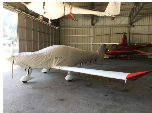
Dynaero MCR.4 Pickup Complete Cover Set.