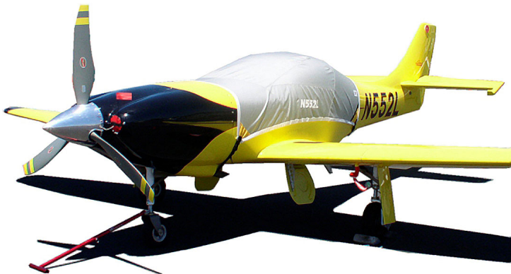
Canopy Cover for Lancair Legacy