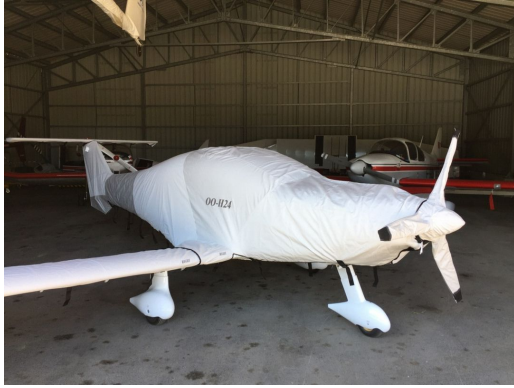
Dynaero MCR.4 Pickup Complete Cover Set.

WINTER USE MATERIAL - Made with Solution-Dyed Polyester fabric, this option is intended for seasonal use to aid in deicing, rain mitigation, or for occasional travel. The material is lighter and more compact, but more susceptible to UV damage and may have a shorter useful life if used continuously outside than the all-year use material.