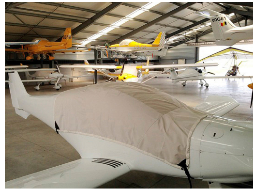
Dynaero MCR Pickup Canopy Cover