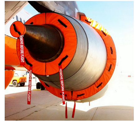
Exhaust Plugs Ship Set, incl. Fan Thrust Reverser and Exhaust Plugs P/N: B767-200 DC-10 Bypass Vent, Exhaust Plug set