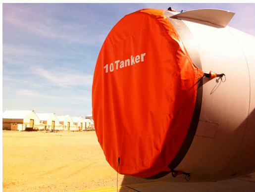
DC-10-30 Intake Cover (CF650C2 Engine)