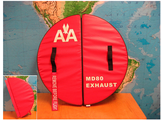
MD-80 Exhaust Plug, folding type