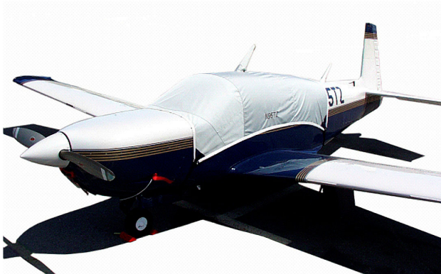
Porsche Mooney Canopy Cover & Plugs

Travel Covers are made with Silver Solution-Dyed Polyester fabric and only lined over the windshield to save weight. The material is lightweight and more compact for easy stowage in the aircraft. The polyester material is water resistant, but only intended for occasional use outside. We also have an ultra lightweight material available for fitted hangar dust covers. For daily outdoor use, the non-travel Sunbrella Cover is the best choice.