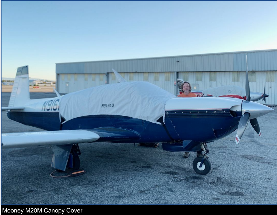
Mooney M20M Canopy Cover