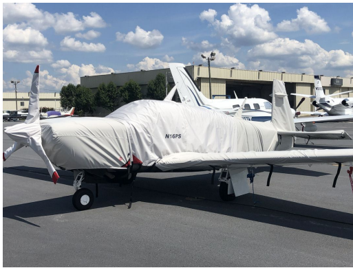
Mooney M20TN Acclaim Full Cover Set

This cover type is made from Silver Acrylic Sunbrella canvas and is 100% lined with a soft and smooth microfiber. Bruce's Custom Covers developed this material combination especially for aircraft protection. The outer material is medium weight and treated for water resistance, UV resistance and anti-static buildup. The inner lining is a very soft and smooth microfiber to prevent scratching. The material is very reflective, and tests show that the cabin interior temperature can be reduced to near-ambient temperature on the hottest of days. It is water, ice and snow repellent, yet breathable to allow moisture to escape from between the cover and the aircraft surface.