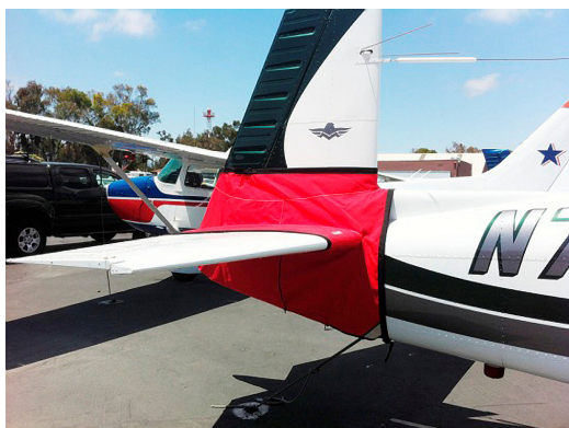
Mooney Tailcone Cover, completely enclosed

WINTER USE MATERIAL - Made with Solution-Dyed Polyester fabric, this option is intended for seasonal use to aid in deicing, rain mitigation, or for occasional travel. The material is lighter and more compact, but more susceptible to UV damage and may have a shorter useful life if used continuously outside than the all-year use material.