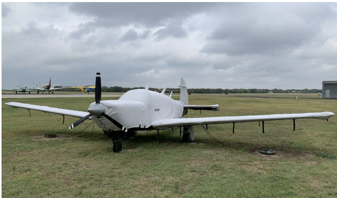
Mooney M20M Bravo Cover Set

WINTER USE MATERIAL - Made with Solution-Dyed Polyester fabric, this option is intended for seasonal use to aid in deicing, rain mitigation, or for occasional travel. The material is lighter and more compact, but more susceptible to UV damage and may have a shorter useful life if used continuously outside than the all-year use material.