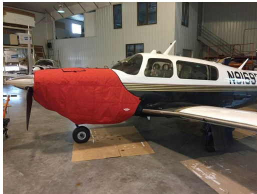
Mooney Ovation Insulated Engine Cover

This cover type is made from Silver Acrylic Sunbrella canvas and is 100% lined with a soft and smooth microfiber. Bruce's Custom Covers developed this material combination especially for aircraft protection. The outer material is medium weight and treated for water resistance, UV resistance and anti-static buildup. The inner lining is a very soft and smooth microfiber to prevent scratching. The material is very reflective, and tests show that the cabin interior temperature can be reduced to near-ambient temperature on the hottest of days. It is water, ice and snow repellent, yet breathable to allow moisture to escape from between the cover and the aircraft surface.