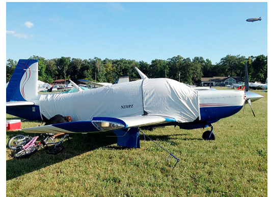
Mooney 231 Extended Canopy Cover