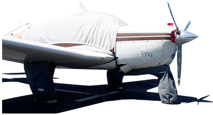
Beech Bonanza/Debonair/Baron Landing Gear Covers