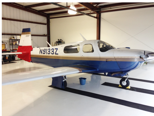
Mooney Tailcone Cover

WINTER USE MATERIAL - Made with Solution-Dyed Polyester fabric, this option is intended for seasonal use to aid in deicing, rain mitigation, or for occasional travel. The material is lighter and more compact, but more susceptible to UV damage and may have a shorter useful life if used continuously outside than the all-year use material.