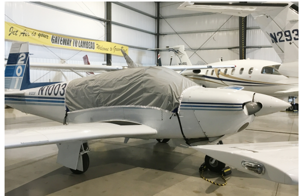
Mooney 201 Travel Cover, Light Weight Travel Canopy Cover, 5 Lbs