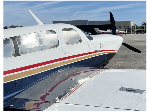
Mooney M20S Heatshield Set