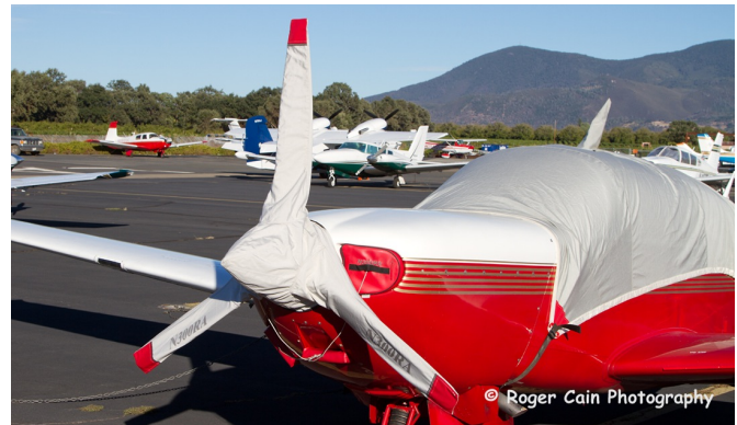
Mooney M20M Bravo 3-Blade Prop Cover, Engine Plugs