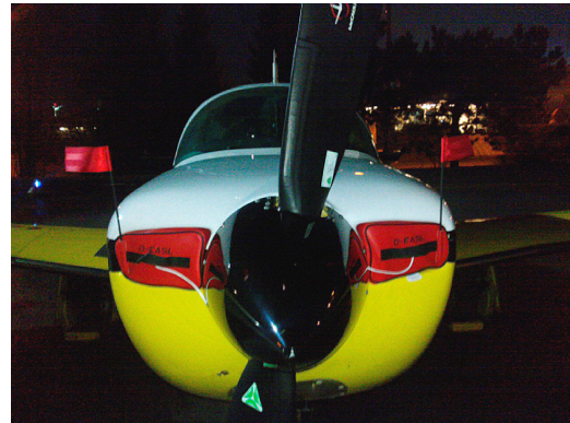
Mooney 231 Engine Inlet Plugs