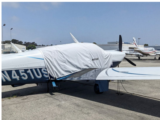
Mooney Ovation Extended Canopy Cover

This cover type is made from Silver Acrylic Sunbrella canvas and is 100% lined with a soft and smooth microfiber. Bruce's Custom Covers developed this material combination especially for aircraft protection. The outer material is medium weight and treated for water resistance, UV resistance and anti-static buildup. The inner lining is a very soft and smooth microfiber to prevent scratching. The material is very reflective, and tests show that the cabin interior temperature can be reduced to near-ambient temperature on the hottest of days. It is water, ice and snow repellent, yet breathable to allow moisture to escape from between the cover and the aircraft surface.