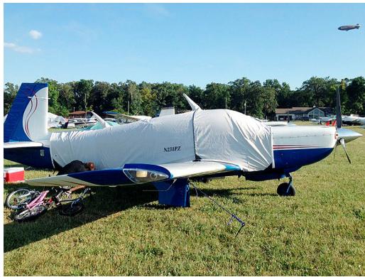
Mooney 231 Extended Canopy Cover

This cover type is made from Silver Acrylic Sunbrella canvas and is 100% lined with a soft and smooth microfiber. Bruce's Custom Covers developed this material combination especially for aircraft protection. The outer material is medium weight and treated for water resistance, UV resistance and anti-static buildup. The inner lining is a very soft and smooth microfiber to prevent scratching. The material is very reflective, and tests show that the cabin interior temperature can be reduced to near-ambient temperature on the hottest of days. It is water, ice and snow repellent, yet breathable to allow moisture to escape from between the cover and the aircraft surface.