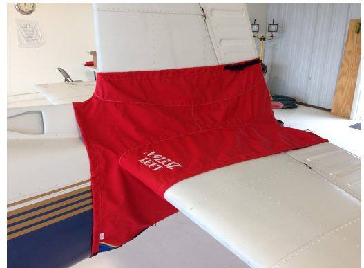
Mooney Tailcone Cover