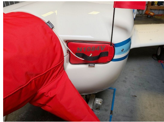
Mooney Engine Inlet Plug & Prop Cover