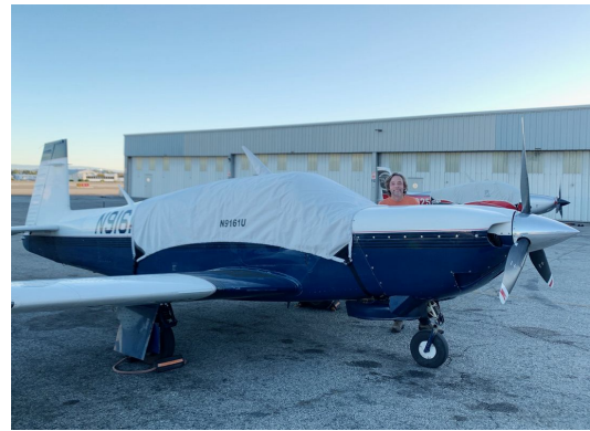
Mooney M20M Canopy Cover