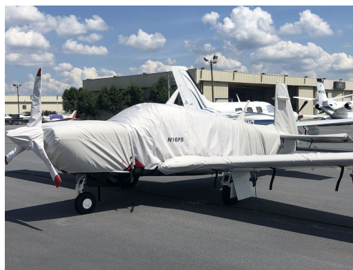
Mooney M20TN Acclaim Full Cover Set