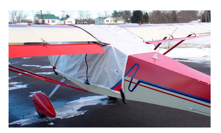
Kitfox IV Over-the-top Canopy Cover