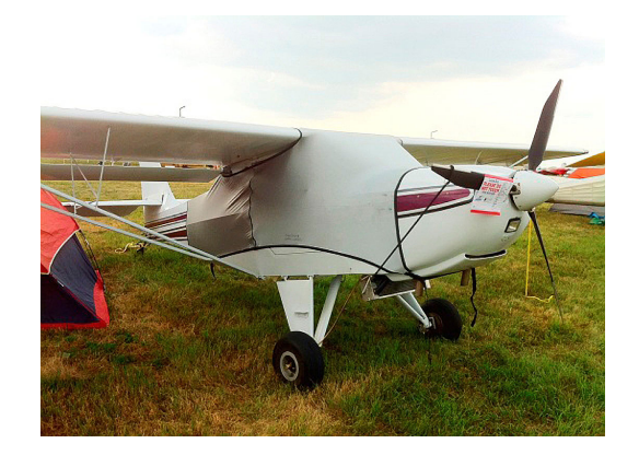
Kitfox Spandex FlyAway Travel Canopy Cover