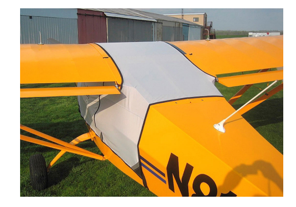
Aerotrek A240 Spandex FlyAway Travel Canopy Cover

Travel Covers are made with Silver Solution-Dyed Polyester fabric and only lined over the windshield to save weight. The material is lightweight and more compact for easy stowage in the aircraft. The polyester material is water resistant, but only intended for occasional use outside. We also have an ultra lightweight material available for fitted hangar dust covers. For daily outdoor use, the non-travel Sunbrella Cover is the best choice.