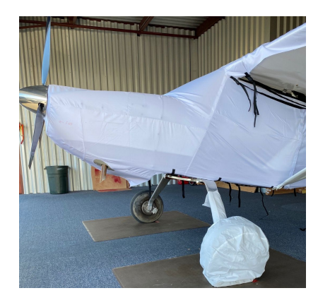
Kitfox Extended Canopy/Engine Cover, test fit cover

This cover type is made from Silver Acrylic Sunbrella canvas and is 100% lined with a soft and smooth microfiber. Bruce's Custom Covers developed this material combination especially for aircraft protection. The outer material is medium weight and treated for water resistance, UV resistance and anti-static buildup. The inner lining is a very soft and smooth microfiber to prevent scratching. The material is very reflective, and tests show that the cabin interior temperature can be reduced to near-ambient temperature on the hottest of days. It is water, ice and snow repellent, yet breathable to allow moisture to escape from between the cover and the aircraft surface.