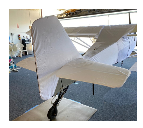
Kitfox Empennage Cover, test fit cover