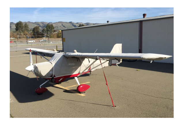
Eurofox Canopy, Engine, Wings and Empennage Covers

WINTER USE MATERIAL - Made with Solution-Dyed Polyester fabric, this option is intended for seasonal use to aid in deicing, rain mitigation, or for occasional travel. The material is lighter and more compact, but more susceptible to UV damage and may have a shorter useful life if used continuously outside than the all-year use material.