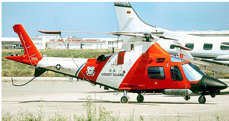
Covers, Plugs, HeatShields and related items for the Agusta MH-68A