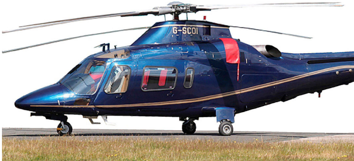
Agusta Power Intake Cover

WINTER USE MATERIAL - Made with Solution-Dyed Polyester fabric, this option is intended for seasonal use to aid in deicing, rain mitigation, or for occasional travel. The material is lighter and more compact, but more susceptible to UV damage and may have a shorter useful life if used continuously outside than the all-year use material.