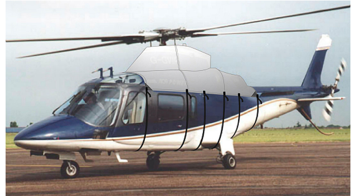
Agusta Power Engine Cover (illustration)