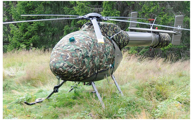
MD520 NOTAR Bubble, Engine, & NOTAR Covers & Blade Tie-downs