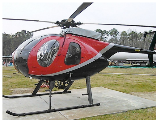
Customized Engine Cover