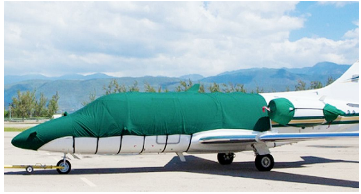
Raytheon Beechjet 400 Fuselage/Nose Cover, Engine Covers