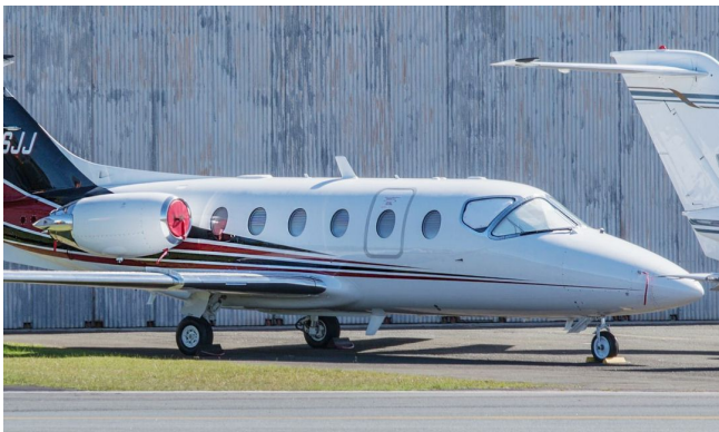
Beechjet Engine Plugs and Cockpit Heatshields

Cockpit Heatshields are interior sunshades for the aircraft's cockpit. The product is a unique composite of closed-cell foam with a silver mylar finish. The semi-rigid design is stiff enough to stand inside the window framing. The set folds up flat and is easily stored in the included storage sleeve. Some designs may require velcro and suction cups. Our Heatshields for jets are offered white side out because some aircraft manufacturers have issued advisories against reflective window inserts due to potential heat damage. A Heatshield is an excellent short-term remedy for cockpit overheating, but an external fabric cover is more effective for long-term protection.