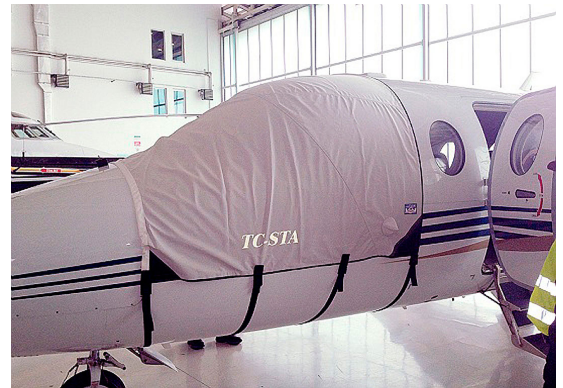
Beechjet 400A Cockpit Cover