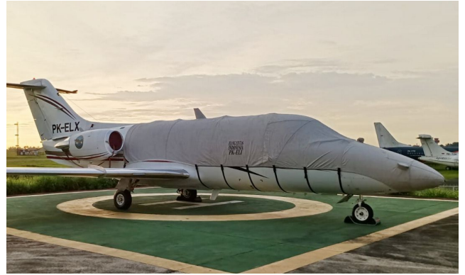
Beechjet Fuselage/Nose Cover