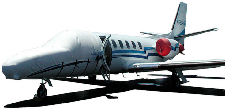
Cessna Citation Nose/Cockpit Cover, Engine Covers

This cover type is made from Silver Acrylic Sunbrella canvas and is 100% lined with a soft and smooth microfiber. Bruce's Custom Covers developed this material combination especially for aircraft protection. The outer material is medium weight and treated for water resistance, UV resistance and anti-static buildup. The inner lining is a very soft and smooth microfiber to prevent scratching. The material is very reflective, and tests show that the cabin interior temperature can be reduced to near-ambient temperature on the hottest of days. It is water, ice and snow repellent, yet breathable to allow moisture to escape from between the cover and the aircraft surface.