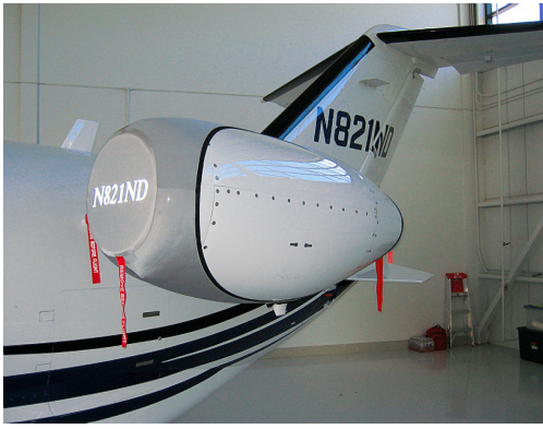
Cessna 510 Mustang Bikini Type Engine Cover