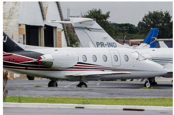
Beechjet Engine Plugs and Cockpit Heatshields