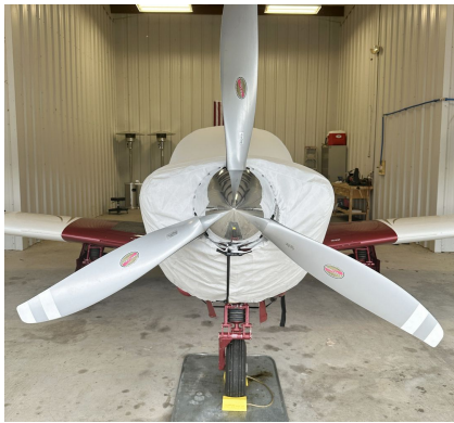
Mooney M20R Extended Canopy/Engine Cover