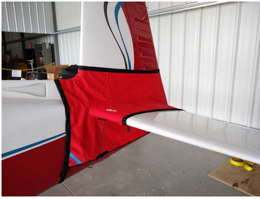
Mooney Tailcone Cover