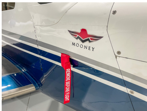
Mooney NACA Vent Plug

Engine Inlet Plugs are custom fit for your Mooney Ovation & Ovation Ultra intakes, made with heavy-duty vinyl material, and stuffed with a single block of sculpted urethane foam. Each plug has a zipper that allows the foam to be removed and dried if necessary. Engine plugs have warning flags that are visible from the cockpit or 'remove before flight' streamers sewn onto the face of the plugs. Most plugs are imprinted with the aircraft registration number in black for an extra charge. Storage bag NOT included. Engine plugs may be inserted after flight when the engine is still warm. Engine Inlet Plugs are commonly referred to as Cowl Plugs, Intake Plugs, Cowl Blocks, Engine Blocks, and Engine Bungs.