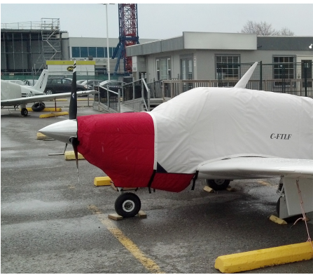
Mooney 201 Insulated Engine Cover, fully enclosed