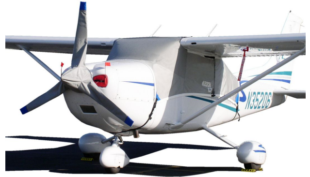
Cessna 182 Canopy Cover, Engine Plugs, 3-Blade Prop Cover