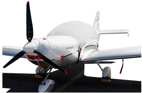
Sportcruiser Canopy Cover & Plugs