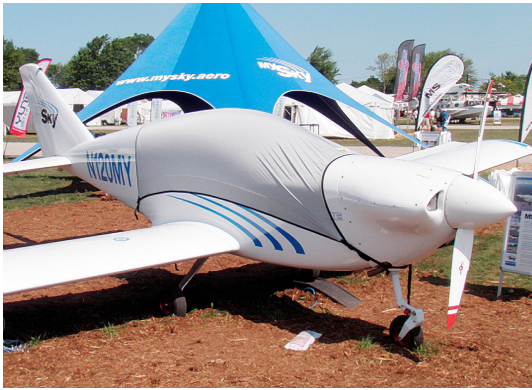
Mysky Fly-Away Travel Cover

Travel Covers are made with Silver Solution-Dyed Polyester fabric and only lined over the windshield to save weight. The material is lightweight and more compact for easy stowage in the aircraft. The polyester material is water resistant, but only intended for occasional use outside. We also have an ultra lightweight material available for fitted hangar dust covers. For daily outdoor use, the non-travel Sunbrella Cover is the best choice.