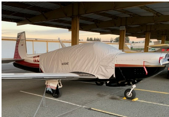
Mooney M20K Extended Canopy Cover

This cover type is made from Silver Acrylic Sunbrella canvas and is 100% lined with a soft and smooth microfiber. Bruce's Custom Covers developed this material combination especially for aircraft protection. The outer material is medium weight and treated for water resistance, UV resistance and anti-static buildup. The inner lining is a very soft and smooth microfiber to prevent scratching. The material is very reflective, and tests show that the cabin interior temperature can be reduced to near-ambient temperature on the hottest of days. It is water, ice and snow repellent, yet breathable to allow moisture to escape from between the cover and the aircraft surface.