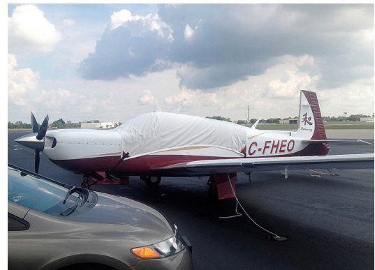
Mooney TLS Canopy Cover