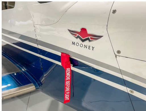
Mooney NACA Vent Plug

Engine Inlet Plugs are custom fit for your Mooney TLS, Bravo, Acclaim TN, Type S, & Porsche Powered Models intakes, made with heavy-duty vinyl material, and stuffed with a single block of sculpted urethane foam. Each plug has a zipper that allows the foam to be removed and dried if necessary. Engine plugs have warning flags that are visible from the cockpit or 'remove before flight' streamers sewn onto the face of the plugs. Most plugs are imprinted with the aircraft registration number in black for an extra charge. Storage bag NOT included. Engine plugs may be inserted after flight when the engine is still warm. Engine Inlet Plugs are commonly referred to as Cowl Plugs, Intake Plugs, Cowl Blocks, Engine Blocks, and Engine Bungs.