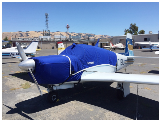
Mooney M20 Canopy & Engine Cover

This cover type is made from Silver Acrylic Sunbrella canvas and is 100% lined with a soft and smooth microfiber. Bruce's Custom Covers developed this material combination especially for aircraft protection. The outer material is medium weight and treated for water resistance, UV resistance and anti-static buildup. The inner lining is a very soft and smooth microfiber to prevent scratching. The material is very reflective, and tests show that the cabin interior temperature can be reduced to near-ambient temperature on the hottest of days. It is water, ice and snow repellent, yet breathable to allow moisture to escape from between the cover and the aircraft surface.