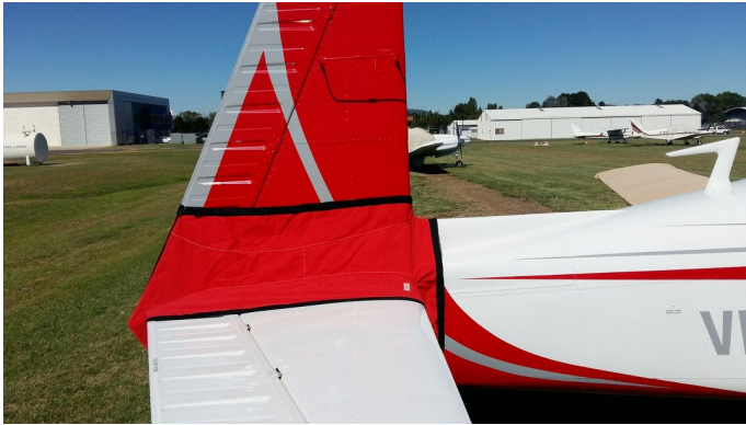
Mooney M20J Tailcone Cover

WINTER USE MATERIAL - Made with Solution-Dyed Polyester fabric, this option is intended for seasonal use to aid in deicing, rain mitigation, or for occasional travel. The material is lighter and more compact, but more susceptible to UV damage and may have a shorter useful life if used continuously outside than the all-year use material.