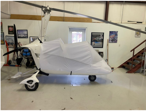
MTO Sport Gyrocopter Canopy/Nose Cover, test fit cover