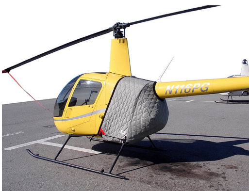
Robinson R-22 Insulated Engine Cover (also covers bottom) & Front Blade Tie-down

Bruce's Autogyro MTO Sport, 2010, 2017 Gyrocopter Blade Covers are made of medium-weight Solution-Dyed Polyester and designed to avoid trim tabs or wicks. You can install Blade Covers from the ground with the aid of a lightweight rope attached to the open end. Covers are cinched tight at the blade root with straps and quick-release plastic buckles. The Cold Weather Blade Covers are fitted with full-length zippers and optional deice "boots" designed to accept a preheater hose; a small opening at the tip of the cover allows for some air circulation and drainage in freezing weather. Some part numbers have features for an extra charge.