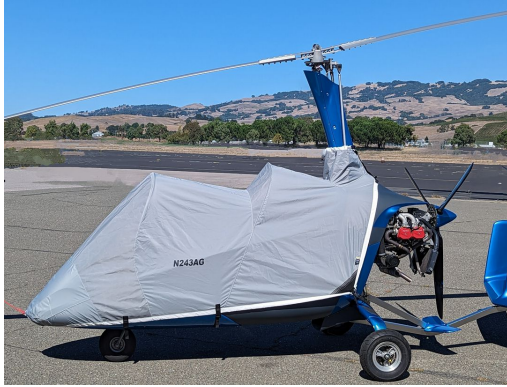
Autogyro MTOSPORT Travel Cover, Light Weight Canopy/Nose Cover

Travel Covers are made with Silver Solution-Dyed Polyester fabric and fully lined over the entire cover. The material is lightweight and more compact for easy storage in the aircraft. The polyester material is water resistant, but only intended for occasional use outside. We also have an ultra lightweight material available for fitted hangar dust covers. For daily outdoor use, the non-travel Sunbrella Cover is the best choice.