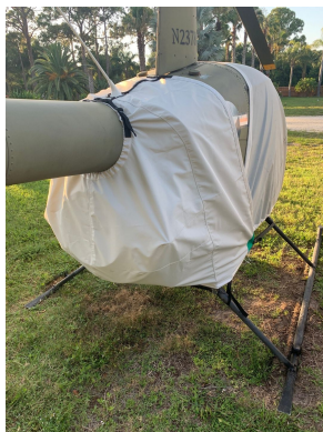
Robinson R-22 Engine Cover

Bruce's Autogyro MTO Sport, 2010, 2017 Gyrocopter Blade Covers are made of medium-weight Solution-Dyed Polyester and designed to avoid trim tabs or wicks. You can install Blade Covers from the ground with the aid of a lightweight rope attached to the open end. Covers are cinched tight at the blade root with straps and quick-release plastic buckles. The Cold Weather Blade Covers are fitted with full-length zippers and optional deice "boots" designed to accept a preheater hose; a small opening at the tip of the cover allows for some air circulation and drainage in freezing weather. Some part numbers have features for an extra charge.