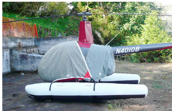
Robinson R-22 Standard Bubble Cover & Engine Cover