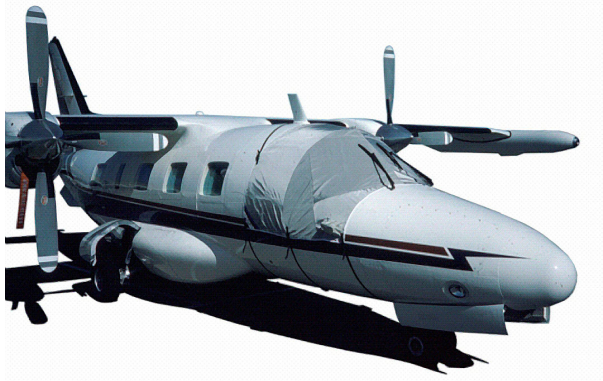
MU-2 Windshield Cover & Engine Plugs

This cover type is made from Silver Acrylic Sunbrella canvas and is 100% lined with a soft and smooth microfiber. Bruce's Custom Covers developed this material combination especially for aircraft protection. The outer material is medium weight and treated for water resistance, UV resistance and anti-static buildup. The inner lining is a very soft and smooth microfiber to prevent scratching. The material is very reflective, and tests show that the cabin interior temperature can be reduced to near-ambient temperature on the hottest of days. It is water, ice and snow repellent, yet breathable to allow moisture to escape from between the cover and the aircraft surface.