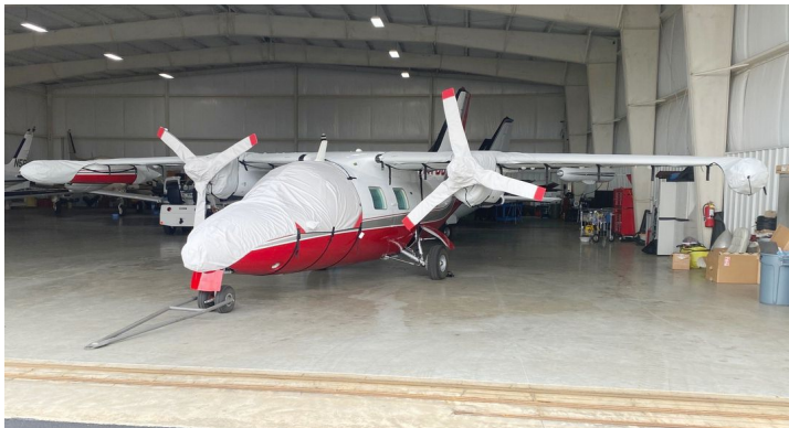
MU-2 Cockpit/Nose, Wing/Engine & Prop Covers

This cover type is made from Silver Acrylic Sunbrella canvas and is 100% lined with a soft and smooth microfiber. Bruce's Custom Covers developed this material combination especially for aircraft protection. The outer material is medium weight and treated for water resistance, UV resistance and anti-static buildup. The inner lining is a very soft and smooth microfiber to prevent scratching. The material is very reflective, and tests show that the cabin interior temperature can be reduced to near-ambient temperature on the hottest of days. It is water, ice and snow repellent, yet breathable to allow moisture to escape from between the cover and the aircraft surface.