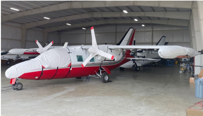
MU-2 Cockpit/Nose, Wing/Engine &amp; Prop Covers