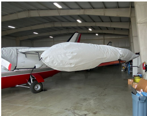
MU-2 Wing/Engine Covers

WINTER USE MATERIAL - Made with Solution-Dyed Polyester fabric, this option is intended for seasonal use to aid in deicing, rain mitigation, or for occasional travel. The material is lighter and more compact, but more susceptible to UV damage and may have a shorter useful life if used continuously outside than the all-year use material.