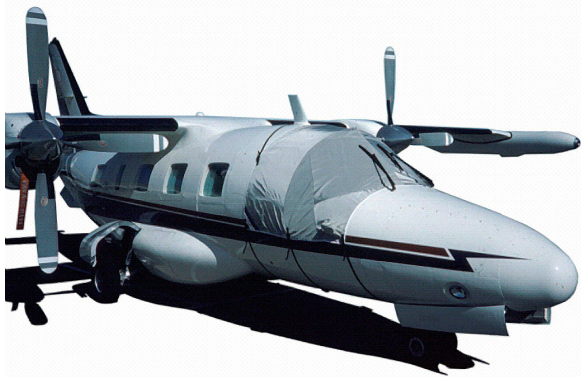
MU-2 Windshield Cover & Engine Plugs

Travel Covers are made with Silver Solution-Dyed Polyester fabric and only lined over the windshield to save weight. The material is lightweight and more compact for easy stowage in the aircraft. The polyester material is water resistant, but only intended for occasional use outside. We also have an ultra lightweight material available for fitted hangar dust covers. For daily outdoor use, the non-travel Sunbrella Cover is the best choice.