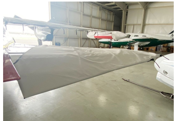
MU-2 Horizontal Stabilizer Covers