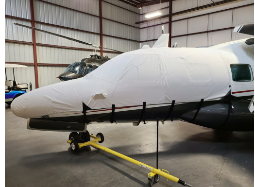
Mitsubishi MU-2 Cockpit/Nose Cover, long body model