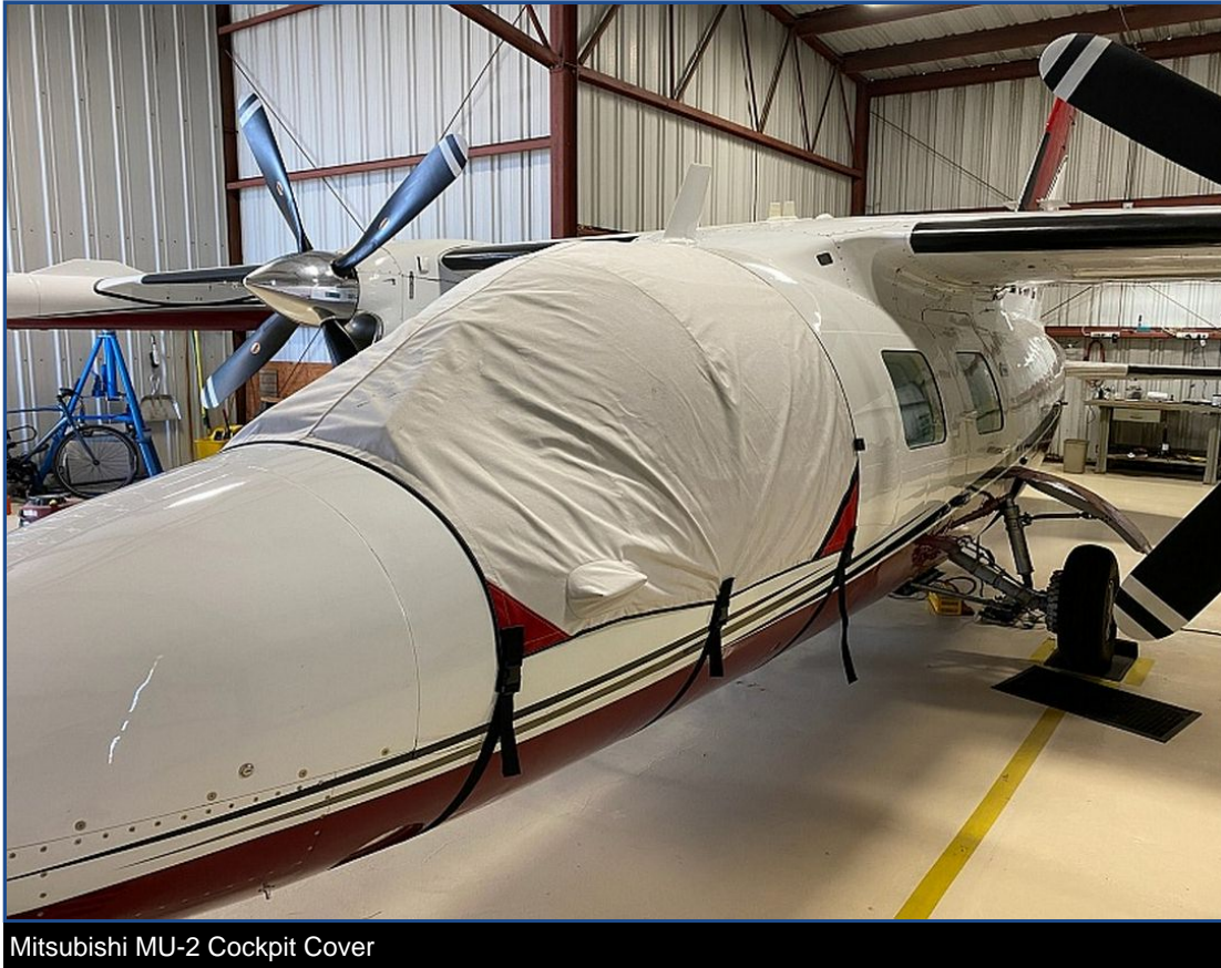
Mitsubishi MU-2 Cockpit Cover