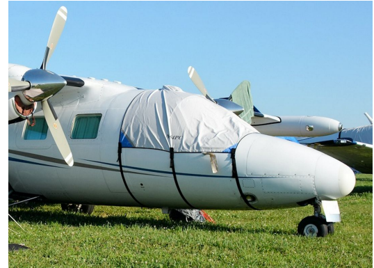
Cockpit cover on the Upper Forty.