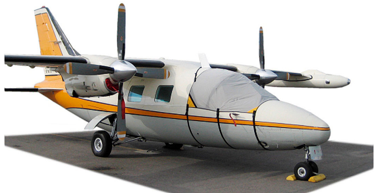
MU-2 Windshield Cover & Engine Plugs