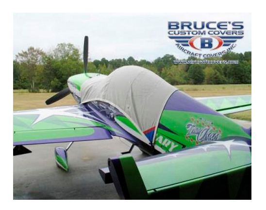
MX-2 Canopy Cover