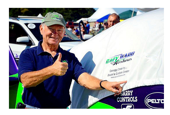
MX-2 Canopy Cover