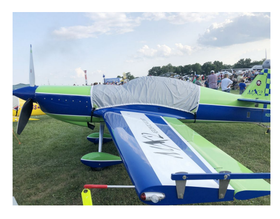
MX2 Lightweight Travel Canopy Cover