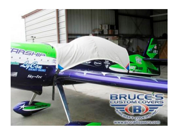
MX-2 Canopy Cover