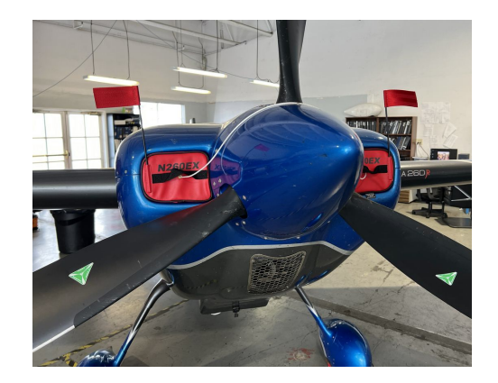
Extra 260 Engine Inlet Plugs

Engine Inlet Plugs are custom fit for your MXR Technologies MXS & MX2 intakes, made with heavy-duty vinyl material, and stuffed with a single block of sculpted urethane foam. Each plug has a zipper that allows the foam to be removed and dried if necessary. Engine plugs have warning flags that are visible from the cockpit or 'remove before flight' streamers sewn onto the face of the plugs. Most plugs are imprinted with the aircraft registration number in black for an extra charge. Storage bag NOT included. Engine plugs may be inserted after flight when the engine is still warm. Engine Inlet Plugs are commonly referred to as Cowl Plugs, Intake Plugs, Cowl Blocks, Engine Blocks, and Engine Bungs.