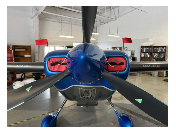
Extra 260 Engine Inlet Plugs