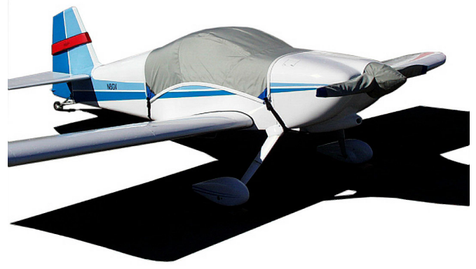
Canopy Cover, Prop Cover