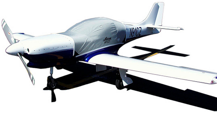
Canopy Cover for Lancair 320/360