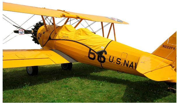
Stearman Canopy Cover