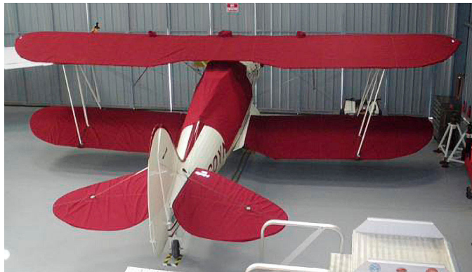
Waco UPF-7 Horizontal Stab. Cover