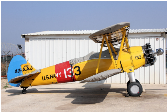
Boeing Stearman PT-13 Canopy, Wing & Horiz. Stab Covers

WINTER USE MATERIAL - Made with Solution-Dyed Polyester fabric, this option is intended for seasonal use to aid in deicing, rain mitigation, or for occasional travel. The material is lighter and more compact, but more susceptible to UV damage and may have a shorter useful life if used continuously outside than the all-year use material.