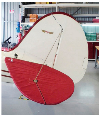
Waco UPF-7 Horizontal Stab. Cover