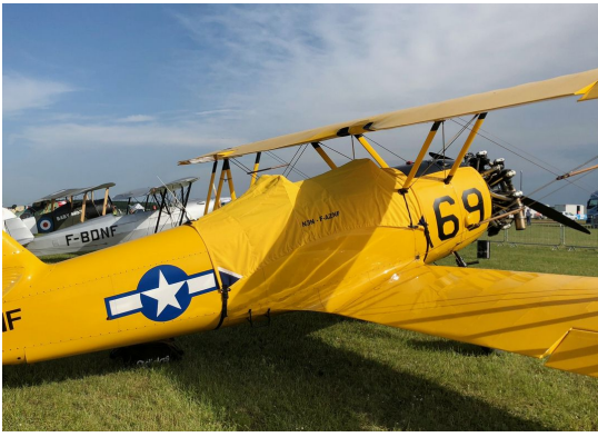
Naval Aircraft Factory N3N Canopy Cover