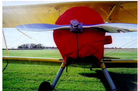
Stearman Engine Cover