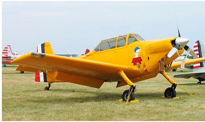
Canopy Cover for the Nord Tandem Trainer 3202