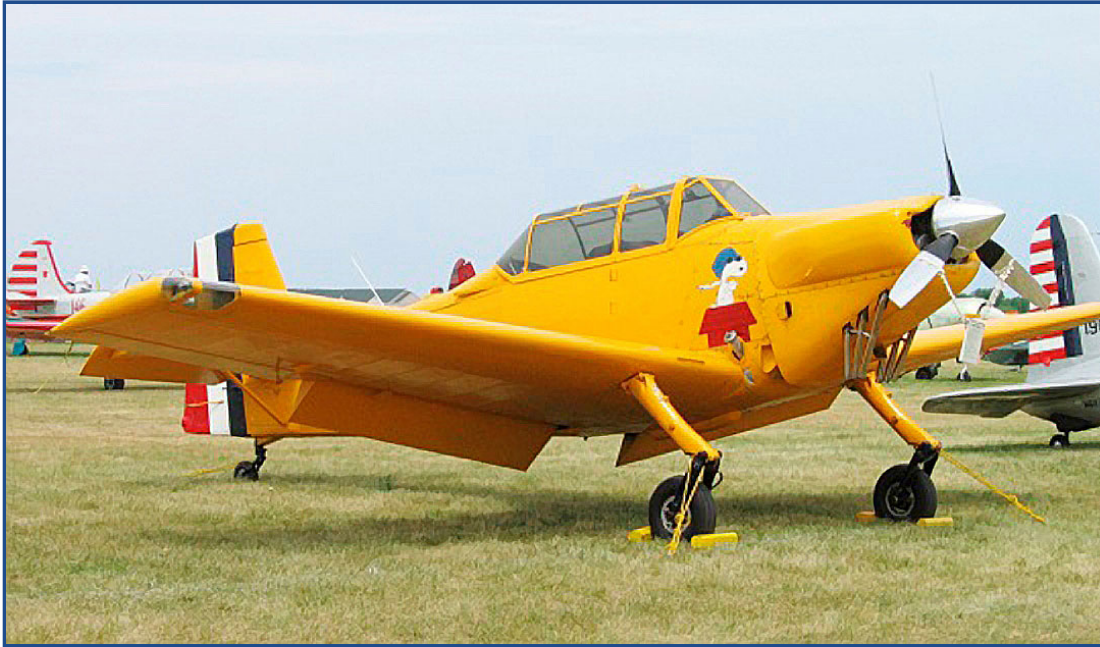
Canopy Cover for the Nord Tandem Trainer 3202