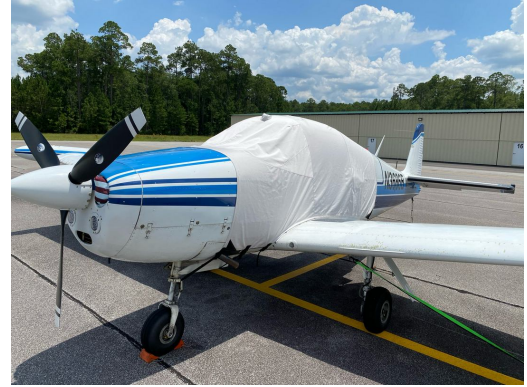
Navion Rangemaster Extended Canopy Cover