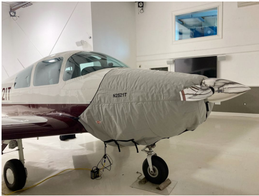
NAVION H Insulated Engine Cover

This cover type is made from Silver Acrylic Sunbrella canvas and is 100% lined with a soft and smooth microfiber. Bruce's Custom Covers developed this material combination especially for aircraft protection. The outer material is medium weight and treated for water resistance, UV resistance and anti-static buildup. The inner lining is a very soft and smooth microfiber to prevent scratching. The material is very reflective, and tests show that the cabin interior temperature can be reduced to near-ambient temperature on the hottest of days. It is water, ice and snow repellent, yet breathable to allow moisture to escape from between the cover and the aircraft surface.