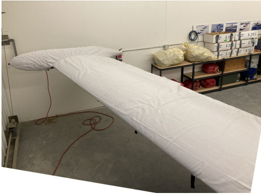
Navion Rangemaster Wing Covers

shorter useful life if used continuously outside than the all-year use material.