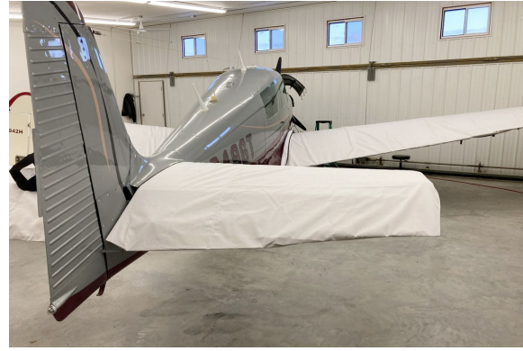
Navion Rangemaster Wing & Horizontal Stabilizer Covers