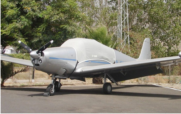
Navion Rangemaster Canopy Cover

This cover type is made from Silver Acrylic Sunbrella canvas and is 100% lined with a soft and smooth microfiber. Bruce's Custom Covers developed this material combination especially for aircraft protection. The outer material is medium weight and treated for water resistance, UV resistance and anti-static buildup. The inner lining is a very soft and smooth microfiber to prevent scratching. The material is very reflective, and tests show that the cabin interior temperature can be reduced to near-ambient temperature on the hottest of days. It is water, ice and snow repellent, yet breathable to allow moisture to escape from between the cover and the aircraft surface.