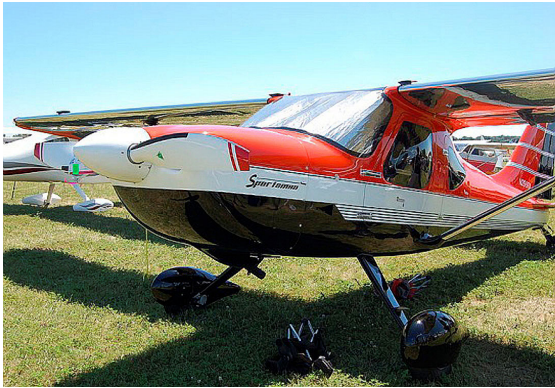
Glastar Sportsman Windshield HeatShield

Windshield Heatshields are interior sunshades for an aircraft's front windshield. The product is a unique composite of closed-cell foam with a silver mylar finish. The semi-rigid design is stiff enough to stand along the inside of the windshield using sun visors or window framing. It folds up flat and easily stores in the included storage sleeve. Some designs may require velcro and suction cups or split right and left sides. A Heatshield is an excellent short-term remedy for cockpit overheating. An external fabric cover is far more effective and practical for long-term protection.