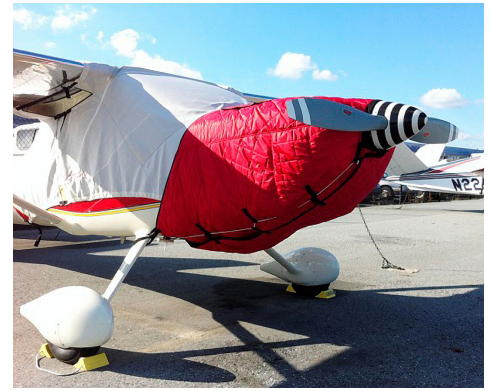
Glastar Insulated Engine Cover