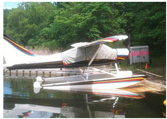
Glastar Sportsman Canopy Cover