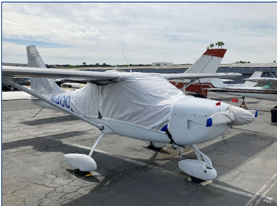
OMF Symphony 160 Canopy Cover, Over Top Type