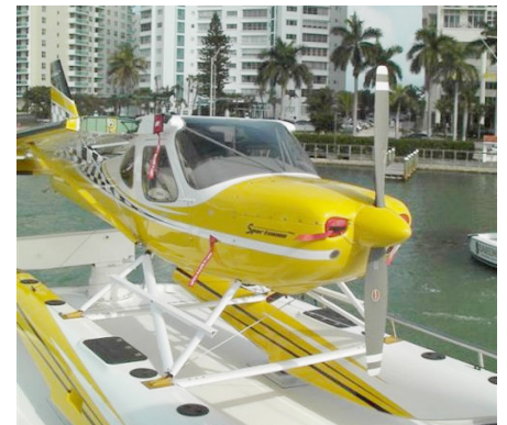
Glastar Engine Plugs