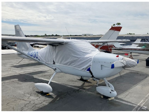
OMF Symphony 160 Canopy Cover, Over Top Type