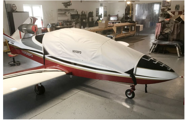
Subsonex Canopy Cover