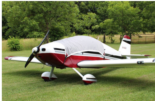
OneX Canopy Cover