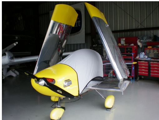
Onex Flyaway Cover

Travel Covers are made with Silver Solution-Dyed Polyester fabric and only lined over the windshield to save weight. The material is lightweight and more compact for easy stowage in the aircraft. The polyester material is water resistant, but only intended for occasional use outside. We also have an ultra lightweight material available for fitted hangar dust covers. For daily outdoor use, the non-travel Sunbrella Cover is the best choice.