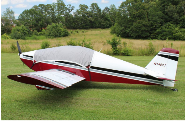
OneX Canopy Cover

Travel Covers are made with Silver Solution-Dyed Polyester fabric and only lined over the windshield to save weight. The material is lightweight and more compact for easy stowage in the aircraft. The polyester material is water resistant, but only intended for occasional use outside. We also have an ultra lightweight material available for fitted hangar dust covers. For daily outdoor use, the non-travel Sunbrella Cover is the best choice.