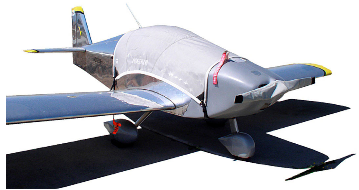
Sonex Canopy Cover