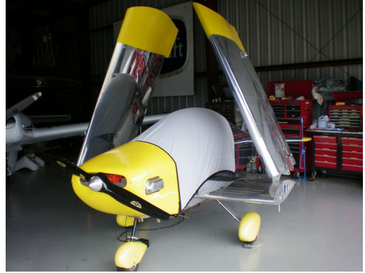
Onex Flyaway Cover