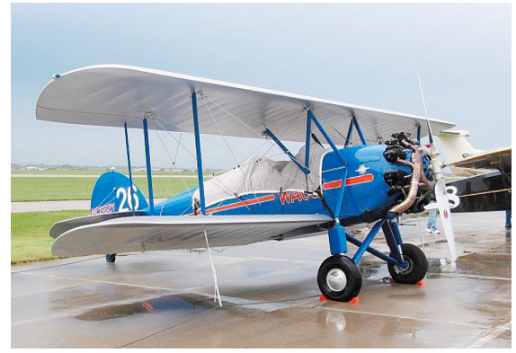
Waco ASO Canopy Cover