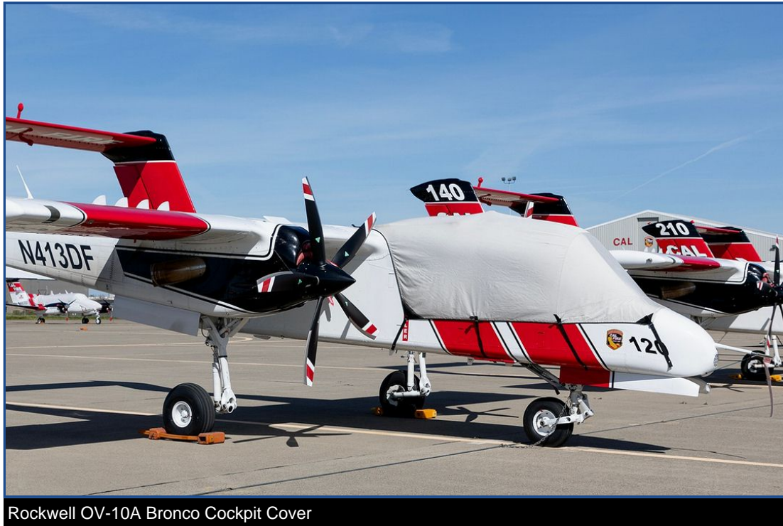
Rockwell OV-10A Bronco Cockpit Cover