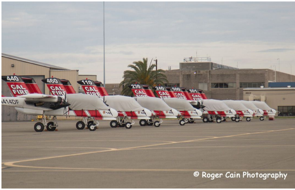
Rockwell OV-10 Bronco Canopy Cover