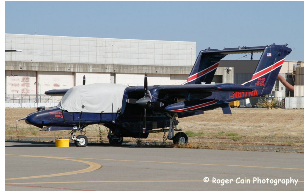
Rockwell OV-10 Bronco Canopy Cover