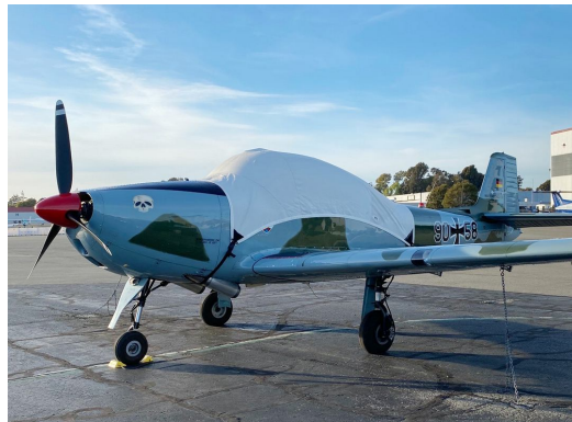
Focke Wulf 149 Trainer Canopy Cover