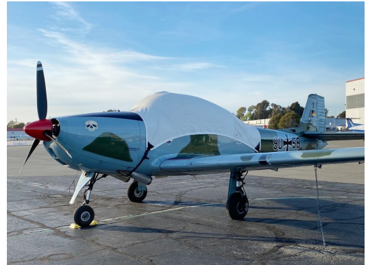
Focke Wulf 149 Trainer Canopy Cover