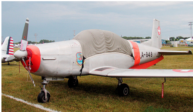
Piaggio P-149D Trainer Canopy Cover

Cover and Engine Cover. This cover will enclose the engine cowl and will extend aft to cover all of the windows. This cover type is made from Silver Acrylic Sunbrella canvas and is 100% lined with a soft and smooth microfiber. Bruce's Custom Covers developed this material combination especially for aircraft protection. The outer material is medium weight and treated for water resistance, UV resistance and anti-static buildup. The inner lining is a very soft and smooth microfiber to prevent scratching. The material is very reflective, and tests show that the cabin interior temperature can be reduced to near-ambient temperature on the hottest of days. It is water, ice and snow repellent, yet breathable to allow moisture to escape from between the cover and the aircraft surface.