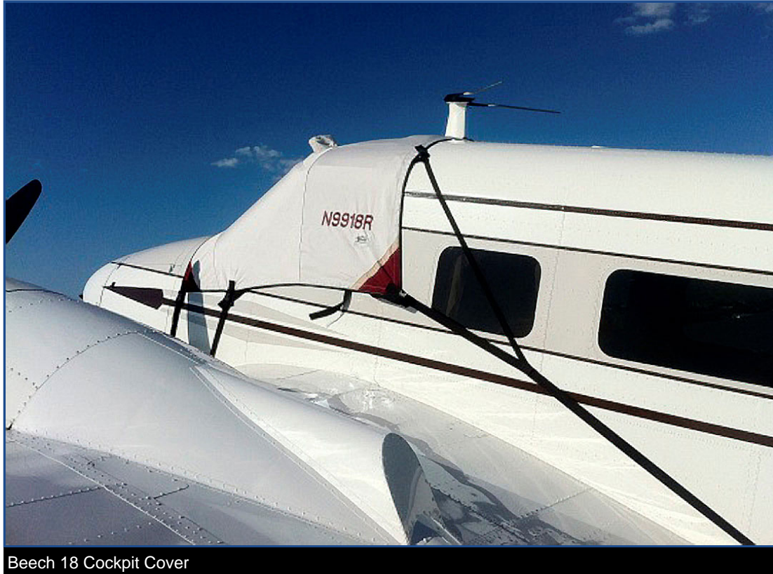
Beech 18 Cockpit Cover