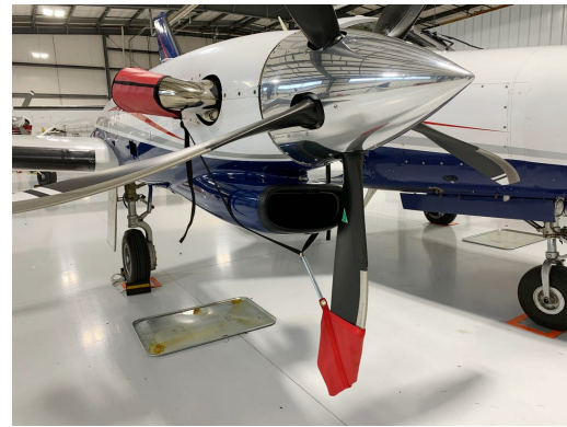
Piper PA-31T Cheyenne II Prop Tie-Downs/Exhaust Covers