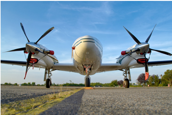
Piper Cheyenne Intake Plugs, Exhaust Covers, Prop Ties

Engine Inlet Plugs are custom fit for your Piper PA-31T: Cheyenne, Cheyenne II XL intakes, made with heavy-duty vinyl material, and stuffed with a single block of sculpted urethane foam. Each plug has a zipper that allows the foam to be removed and dried if necessary. Engine plugs have warning flags that are visible from the cockpit or 'remove before flight' streamers sewn onto the face of the plugs. Most plugs are imprinted with the aircraft registration number in black for an extra charge. Storage bag NOT included. Engine plugs may be inserted after flight when the engine is still warm. Engine Inlet Plugs are commonly referred to as Cowl Plugs, Intake Plugs, Cowl Blocks, Engine Blocks, and Engine Bungs.