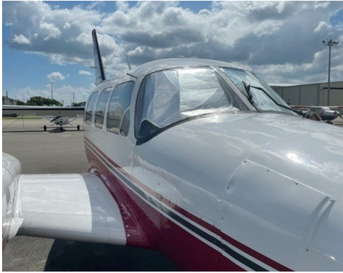
Piper PA-31 Models Cockpit HeatShields

for cockpit overheating, but an external fabric cover is more effective for long-term protection.