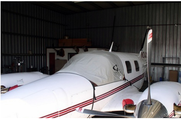
Piper Cheyenne Cockpit Cover

This cover type is made from Silver Acrylic Sunbrella canvas and is 100% lined with a soft and smooth microfiber. Bruce's Custom Covers developed this material combination especially for aircraft protection. The outer material is medium weight and treated for water resistance, UV resistance and anti-static buildup. The inner lining is a very soft and smooth microfiber to prevent scratching. The material is very reflective, and tests show that the cabin interior temperature can be reduced to near-ambient temperature on the hottest of days. It is water, ice and snow repellent, yet breathable to allow moisture to escape from between the cover and the aircraft surface.