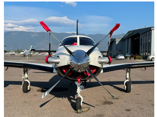
Piper Meridian Prop Tie/Exhaust Cover, Plug Set