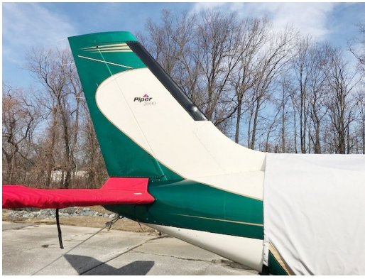
Piper Malibu/Mirage Horizontal Stabilizer/Tailcone Cover