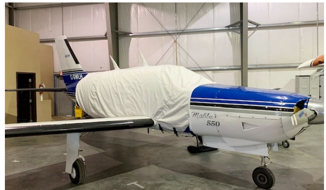
Piper Malibu/Mirage Extended Canopy Cover