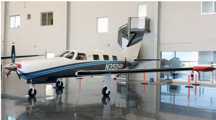
Piper PA-46 Malibu Wingtip Pads

Designed to prevent damage to the aircraft extremities in crowded hangars, these products are made of bright red Naugahyde and thickly padded with a sandwich of closed cell foam.