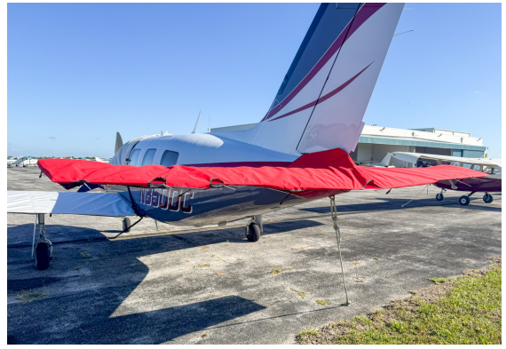
Piper PA 46-350P Horizontal Stabilizer/Tailcone Cover