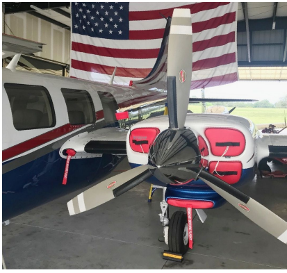
Piper Aerostar Engine Plugs