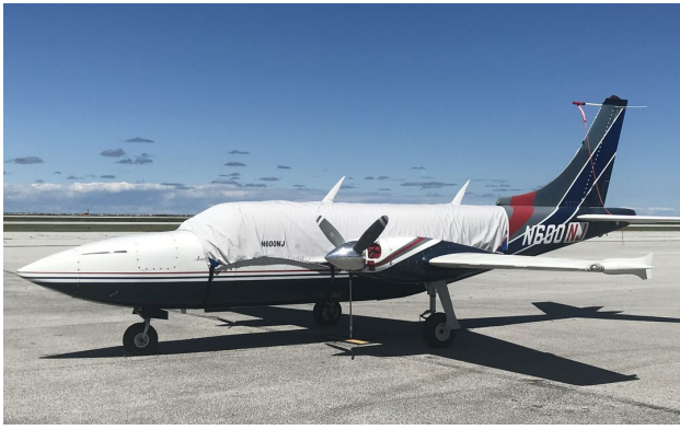
Smith Aerostar 600 Canopy Cover