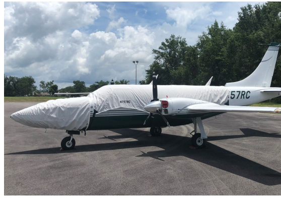
Piper Aerostar Canopy & Nose Covers, Engine Plugs