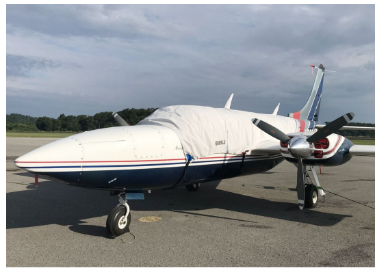
Smith Aerostar 600 Canopy Cover