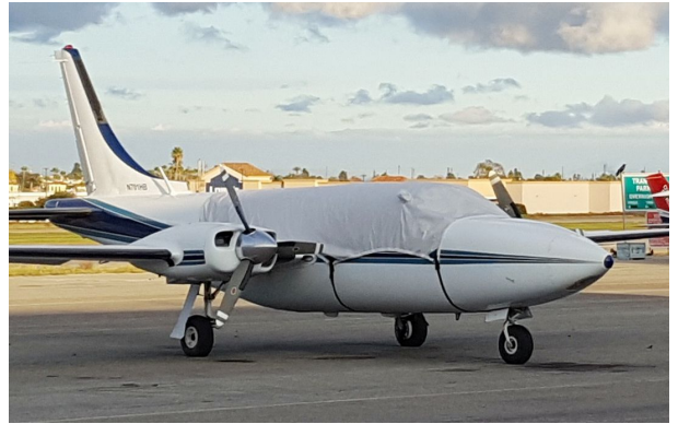
Piper PA-601 Aerostar Canopy Cover (Windows Only)