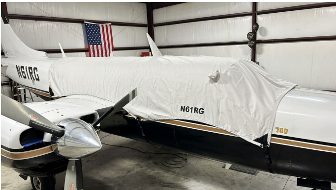
Piper Aerostar 602P Canopy Cover (Windows Only)

The Piper PA-601 Aerostar Nose Cover is designed to cover the section of the fuselage forward of the windshield to the tip of the nose. It is secured with belly straps. This cover type is made from Silver Acrylic Sunbrella canvas and is 100% lined with a soft and smooth microfiber. Bruce's Custom Covers developed this material combination especially for aircraft protection. The outer material is medium weight and treated for water resistance, UV resistance and anti-static buildup. The inner lining is a very soft and smooth microfiber to prevent scratching. The material is very reflective, and tests show that the cabin interior temperature can be reduced to near-ambient temperature on the hottest of days. It is water, ice and snow repellent, yet breathable to allow moisture to escape from between the cover and the aircraft surface.