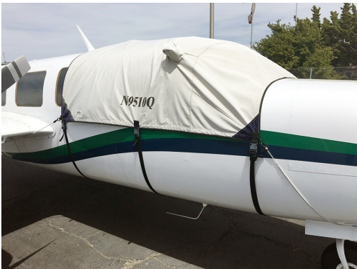
Piper PA-601 Aerostar Cockpit Cover

The Piper PA-601 Aerostar Nose Cover is designed to cover the section of the fuselage forward of the windshield to the tip of the nose. It is secured with belly straps. This cover type is made from Silver Acrylic Sunbrella canvas and is 100% lined with a soft and smooth microfiber. Bruce's Custom Covers developed this material combination especially for aircraft protection. The outer material is medium weight and treated for water resistance, UV resistance and anti-static buildup. The inner lining is a very soft and smooth microfiber to prevent scratching. The material is very reflective, and tests show that the cabin interior temperature can be reduced to near-ambient temperature on the hottest of days. It is water, ice and snow repellent, yet breathable to allow moisture to escape from between the cover and the aircraft surface.