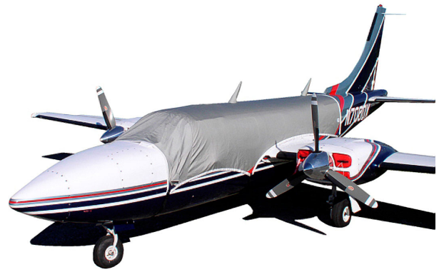
Aerostar Canopy Cover & Plugs