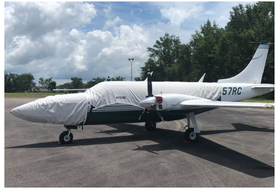
Piper Aerostar Canopy & Nose Covers, Engine Plugs