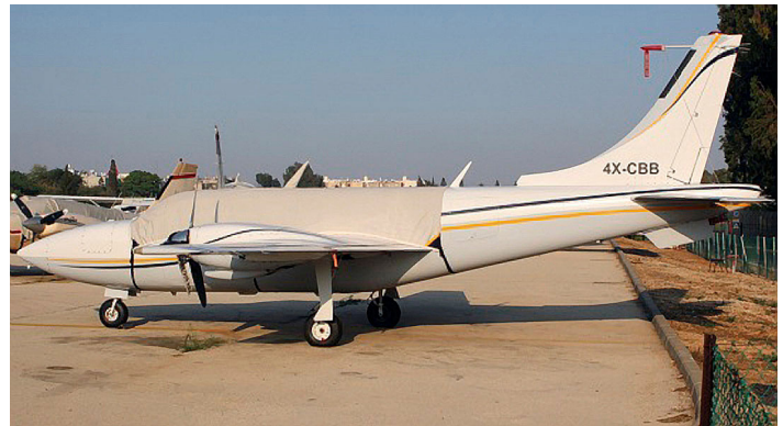
Piper Aerostar Canopy Cover