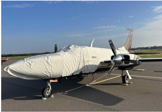
Piper PA-601 Aerostar Fuselage Cover (back to Horiz Stab)

The Piper PA-601 Aerostar Nose Cover is designed to cover the section of the fuselage forward of the windshield to the tip of the nose. It is secured with belly straps. This cover type is made from Silver Acrylic Sunbrella canvas and is 100% lined with a soft and smooth microfiber. Bruce's Custom Covers developed this material combination especially for aircraft protection. The outer material is medium weight and treated for water resistance, UV resistance and anti-static buildup. The inner lining is a very soft and smooth microfiber to prevent scratching. The material is very reflective, and tests show that the cabin interior temperature can be reduced to near-ambient temperature on the hottest of days. It is water, ice and snow repellent, yet breathable to allow moisture to escape from between the cover and the aircraft surface.