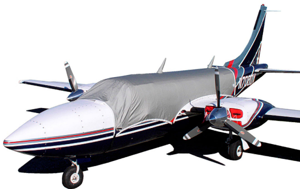
Aerostar Canopy Cover & Plugs

Travel Covers are made with Silver Solution-Dyed Polyester fabric and only lined over the windshield to save weight. The material is lightweight and more compact for easy stowage in the aircraft. The polyester material is water resistant, but only intended for occasional use outside. We also have an ultra lightweight material available for fitted hangar dust covers. For daily outdoor use, the non-travel Sunbrella Cover is the best choice.