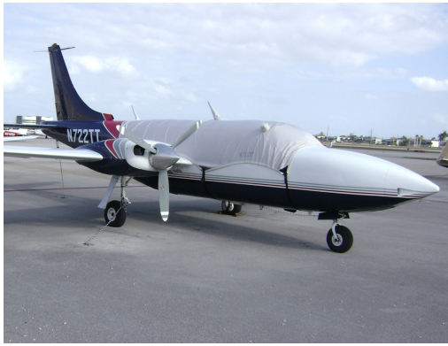
Aerostar Canopy Cover