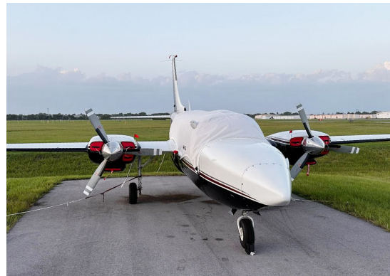
Piper PA-601 Aerostar Canopy Cover (Windows Only), Engine Plugs