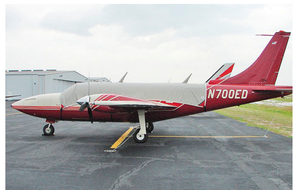
Piper Aerostar Canopy Cover, extended over baggage door