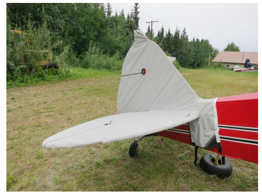
Taylorcraft L-2 Grasshopper Prop, Engine, Canopy, Wing and Empennage Covers Piper PA-12 Abbreviated Empennage Cover