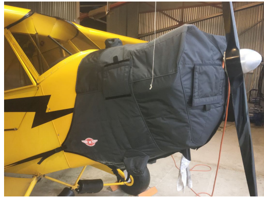
Piper J3 Cub Insulated Engine Cover