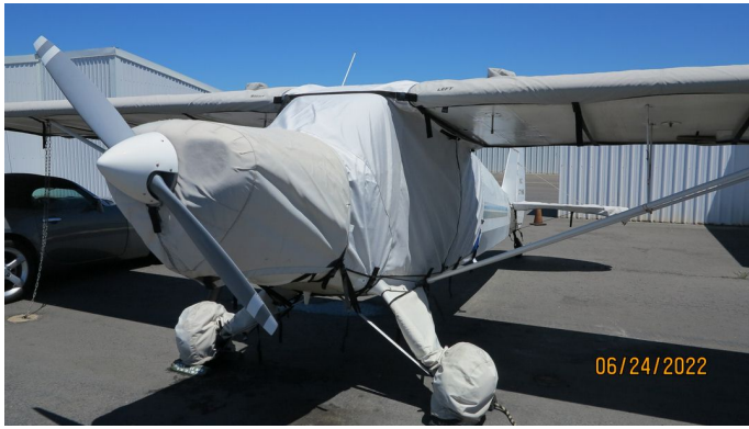
Piper PA-12 Over-Top Canopy Cover, Engine, Wing & Landing Gear Covers