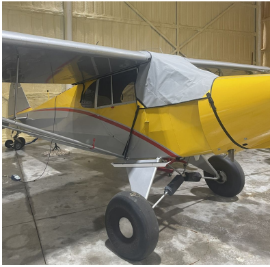
Piper PA-12: Super Cruiser Light Weight Travel Windshield/Skylight Cover

the hottest of days. It is water, ice and snow repellent, yet breathable to allow moisture to escape from between the cover and the aircraft surface.