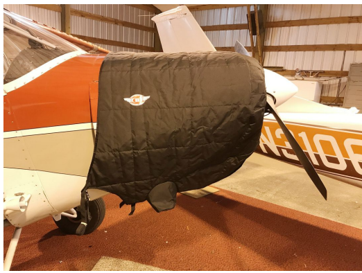
Piper PA-12 Insulated Engine Cover