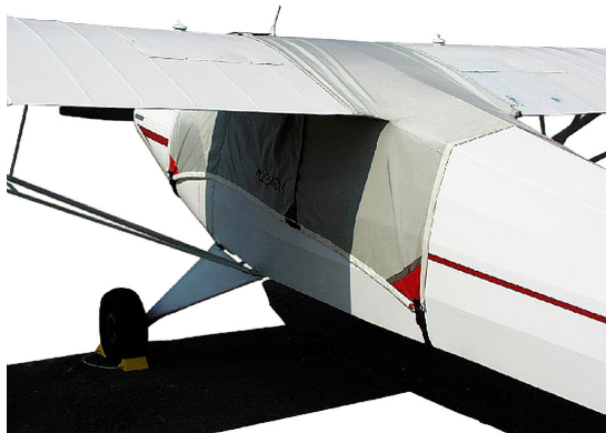
Piper PA-12 Super Cruiser Over-Top Canopy Cover

This cover type is made from Silver Acrylic Sunbrella canvas and is 100% lined with a soft and smooth microfiber. Bruce's Custom Covers developed this material combination especially for aircraft protection. The outer material is medium weight and treated for water resistance, UV resistance and anti-static buildup. The inner lining is a very soft and smooth microfiber to prevent scratching. The material is very reflective, and tests show that the cabin interior temperature can be reduced to near-ambient temperature on the hottest of days. It is water, ice and snow repellent, yet breathable to allow moisture to escape from between the cover and the aircraft surface.