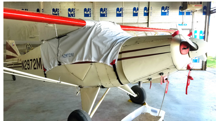
Piper PA-12 Wrap-Around Canopy Cover, Engine Plugs