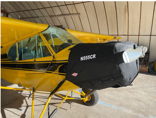
Piper PA-11 Replica Insulated Engine Cover