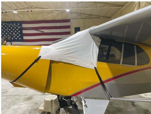
Piper J5A Windshield/Skylight Cover, test fit