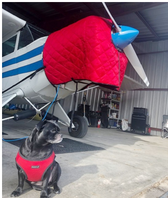
Piper PA-12 Insulated Hangar Blanket

This cover type is made from Silver Acrylic Sunbrella canvas and is 100% lined with a soft and smooth microfiber. Bruce's Custom Covers developed this material combination especially for aircraft protection. The outer material is medium weight and treated for water resistance, UV resistance and anti-static buildup. The inner lining is a very soft and smooth microfiber to prevent scratching. The material is very reflective, and tests show that the cabin interior temperature can be reduced to near-ambient temperature on the hottest of days. It is water, ice and snow repellent, yet breathable to allow moisture to escape from between the cover and the aircraft surface.