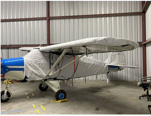
Piper PA-22 Tri-Pacer Extended Canopy Cover, Wing & Empennage Covers