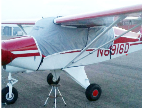
Piper Pacer Travel Cover, Light Weight Travel Canopy Cover (Wrap-Around)

Travel Covers are made with Silver Solution-Dyed Polyester fabric and only lined over the windshield to save weight. The material is lightweight and more compact for easy stowage in the aircraft. The polyester material is water resistant, but only intended for occasional use outside. We also have an ultra lightweight material available for fitted hangar dust covers. For daily outdoor use, the non-travel Sunbrella Cover is the best choice.