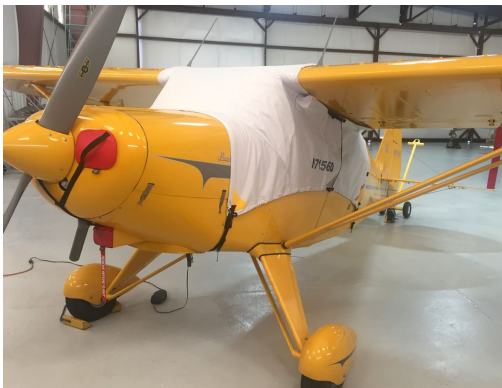
Piper Pacer Over-Top Canopy Cover

This cover type is made from Silver Acrylic Sunbrella canvas and is 100% lined with a soft and smooth microfiber. Bruce's Custom Covers developed this material combination especially for aircraft protection. The outer material is medium weight and treated for water resistance, UV resistance and anti-static buildup. The inner lining is a very soft and smooth microfiber to prevent scratching. The material is very reflective, and tests show that the cabin interior temperature can be reduced to near-ambient temperature on the hottest of days. It is water, ice and snow repellent, yet breathable to allow moisture to escape from between the cover and the aircraft surface.