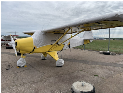
Piper PA-22 Tri-Pacer Cover Set