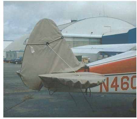
Piper PA-22 Colt Horizontal & Vertical Stabilizer Covers