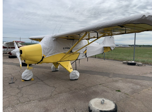
Piper PA-22 Tri-Pacer Cover Set