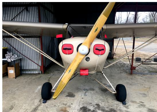
Piper PA-16 Engine Inlet Plugs