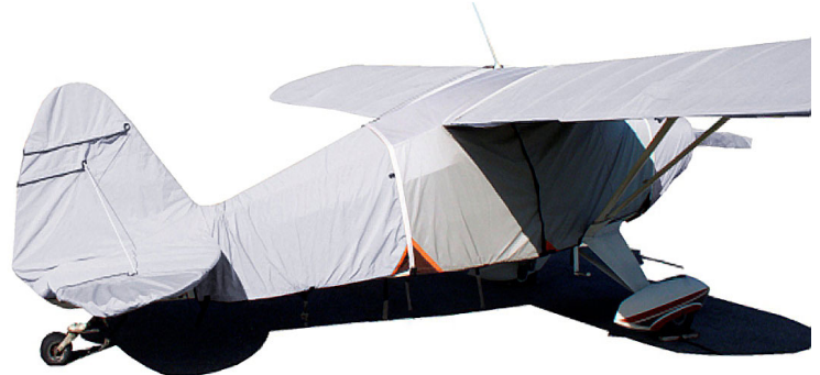
Piper Pacer Full Cover Set