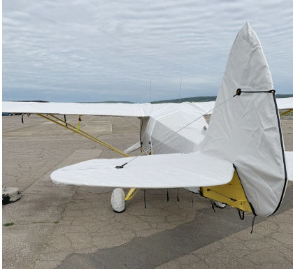
Piper PA-22 Tri-Pacer Empennage Cover

ALL-YEAR USE MATERIAL - Made with Silver Acrylic Sunbrella canvas, the all-year use material is the best option for sun protection and cover longevity. This heavier more durable material is intended for all weather conditions, such as rain and snow or lots of sun.