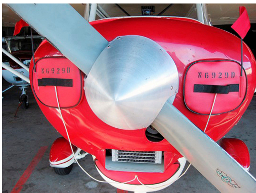
Piper PA-22-150 Engine Inlet Plugs (set of 3)

Engine Inlet Plugs are custom fit for your Piper Clipper, Pacer, Tri-Pacer, Vagabond, Colt: PA-15, 16, 20, 22 intakes, made with heavy-duty vinyl material, and stuffed with a single block of sculpted urethane foam. Each plug has a zipper that allows the foam to be removed and dried if necessary. Engine plugs have warning flags that are visible from the cockpit or 'remove before flight' streamers sewn onto the face of the plugs. Most plugs are imprinted with the aircraft registration number in black for an extra charge. Storage bag NOT included. Engine plugs may be inserted after flight when the engine is still warm. Engine Inlet Plugs are commonly referred to as Cowl Plugs, Intake Plugs, Cowl Blocks, Engine Blocks, and Engine Bungs.