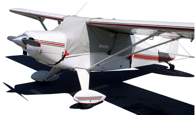
Piper Pacer Canopy Cover