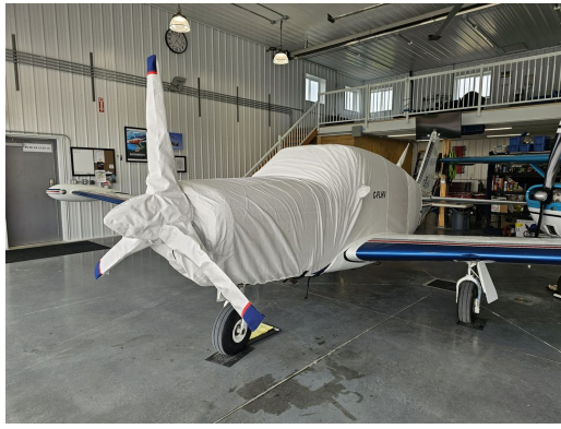
Piper PA-24 Comanche Propellor/Spinner Cover, 3 Blade