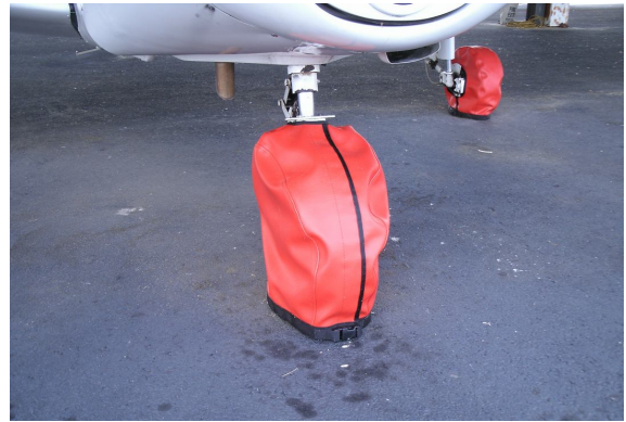
Piper PA28-140 Tire Covers