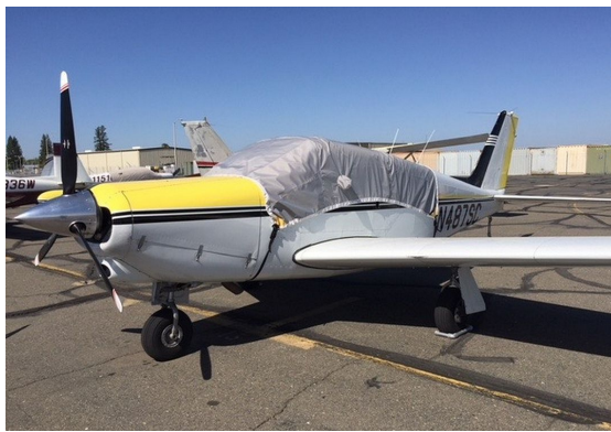
Piper PA-24 Comanche Travel Cover, Light Weight Travel Canopy Cover