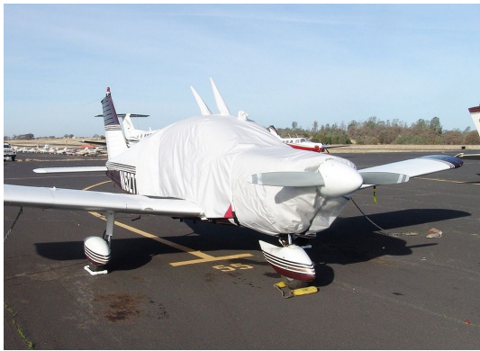
Piper PA-28 Extended Canopy Cover and Engine Cover

This cover type is made from Silver Acrylic Sunbrella canvas and is 100% lined with a soft and smooth microfiber. Bruce's Custom Covers developed this material combination especially for aircraft protection. The outer material is medium weight and treated for water resistance, UV resistance and anti-static buildup. The inner lining is a very soft and smooth microfiber to prevent scratching. The material is very reflective, and tests show that the cabin interior temperature can be reduced to near-ambient temperature on the hottest of days. It is water, ice and snow repellent, yet breathable to allow moisture to escape from between the cover and the aircraft surface.