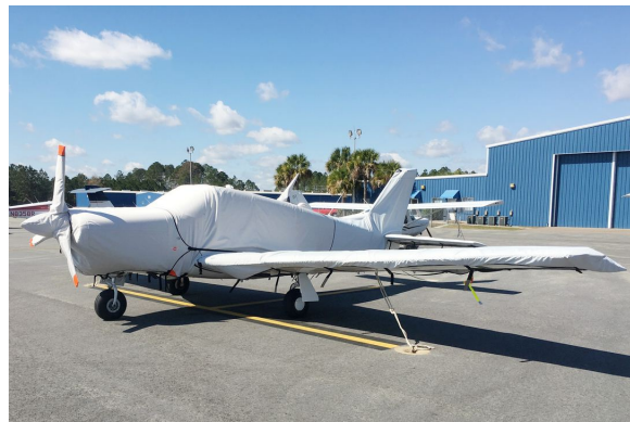
Piper PA-24 Comanche Full Cover Set