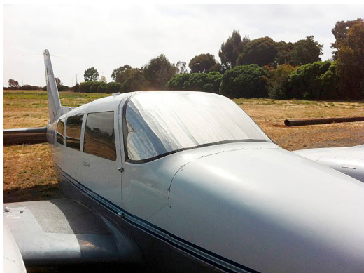
Piper Comanche Windshield HeatShield

Windshield Heatshields are interior sunshades for an aircraft's front windshield. The product is a unique composite of closed-cell foam with a silver mylar finish. The semi-rigid design is stiff enough to stand along the inside of the windshield using sun visors or window framing. It folds up flat and easily stores in the included storage sleeve. Some designs may require velcro and suction cups or split right and left sides. A Heatshield is an excellent short-term remedy for cockpit overheating. An external fabric cover is far more effective and practical for long-term protection.