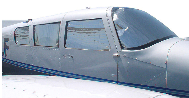
Piper Comanche HeatShield Set