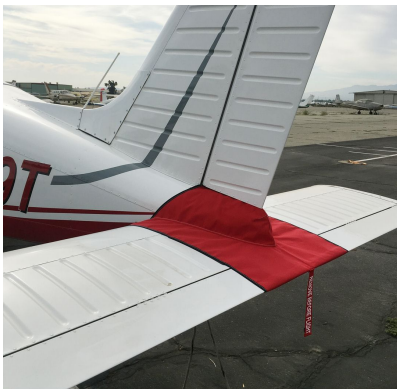
Piper PA-28-140 Tailcone Cover

WINTER USE MATERIAL - Made with Solution-Dyed Polyester fabric, this option is intended for seasonal use to aid in deicing, rain mitigation, or for occasional travel. The material is lighter and more compact, but more susceptible to UV damage and may have a shorter useful life if used continuously outside than the all-year use material.