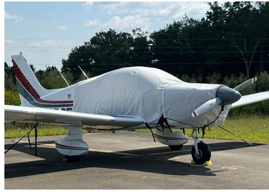
Piper PA-28-181 Extended Canopy Cover & Engine Cover