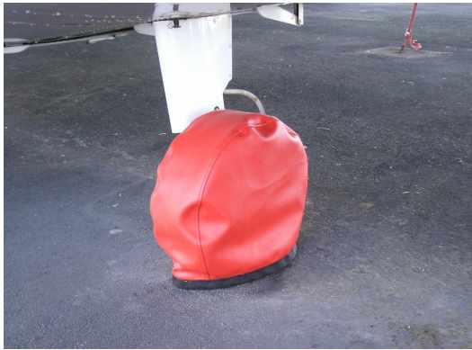
Piper PA28-140 Tire Covers

ALL-YEAR USE MATERIAL - Made with Silver Acrylic Sunbrella canvas, the all-year use material is the best option for sun protection and cover longevity. This heavier more durable material is intended for all weather conditions, such as rain and snow or lots of sun.