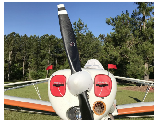
Piper Pawnee PA-25 Engine Inlet Plugs