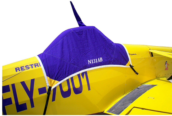
Piper Pawnee Canopy Cover

occasional use outside. We also have an ultra lightweight material available for fitted hangar dust covers. For daily outdoor use, the non-travel Sunbrella Cover is the best choice.