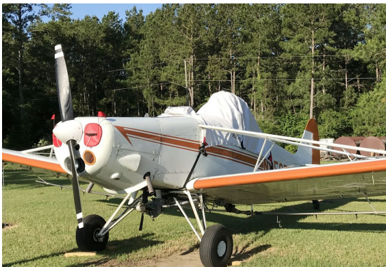
Piper Pawnee PA-25 Canopy/Hopper Cover, Engine Plugs

Engine Inlet Plugs are custom fit for your Piper Pawnee PA-25 intakes, made with heavy-duty vinyl material, and stuffed with a single block of sculpted urethane foam. Each plug has a zipper that allows the foam to be removed and dried if necessary. Engine plugs have warning flags that are visible from the cockpit or 'remove before flight' streamers sewn onto the face of the plugs. Most plugs are imprinted with the aircraft registration number in black for an extra charge. Storage bag NOT included. Engine plugs may be inserted after flight when the engine is still warm. Engine Inlet Plugs are commonly referred to as Cowl Plugs, Intake Plugs, Cowl Blocks, Engine Blocks, and Engine Bungs.