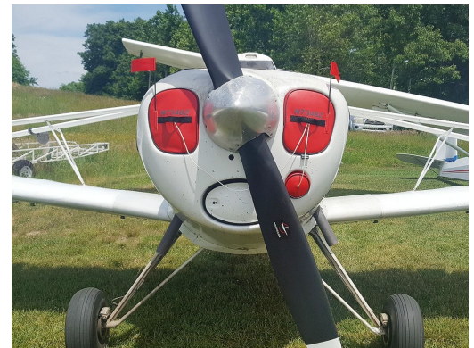
Piper Pa-25-235 Engine Inlet Plugs