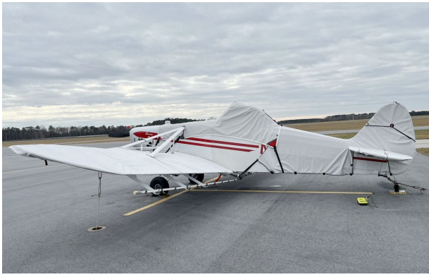
Piper PA-25 Pawnee Cover Set