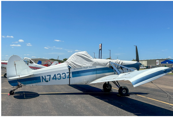
Piper Pawnee PA-25 Canopy/Hopper Cover