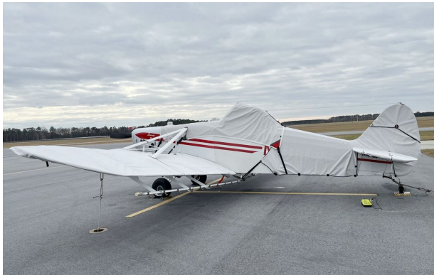
Piper PA-25 Pawnee Cover Set

WINTER USE MATERIAL - Made with Solution-Dyed Polyester fabric, this option is intended for seasonal use to aid in deicing, rain mitigation, or for occasional travel. The material is lighter and more compact, but more susceptible to UV damage and may have a shorter useful life if used continuously outside than the all-year use material.