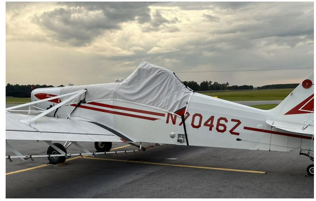
Piper PA-25 Pawnee Canopy/Hopper Cover