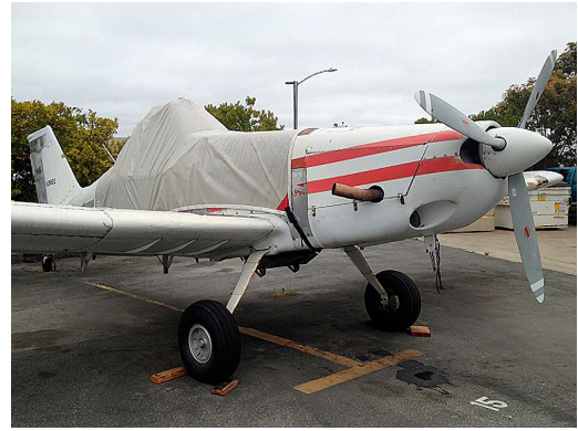
Piper Brave PA-36 Canopy/Hopper Cover