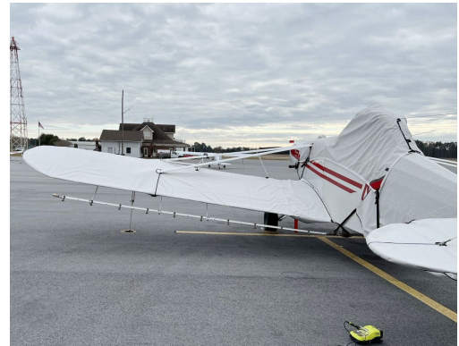
Piper PA-25 Pawnee Cover Set