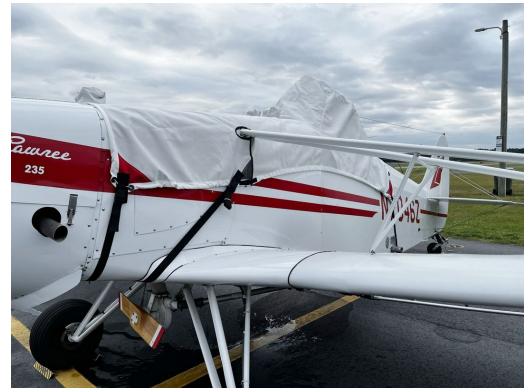
Piper Pawnee PA25 Canopy/Hopper Cover