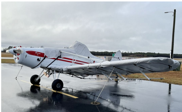
Piper Pawnee Canopy/Hopper, Wing & Empennage Covers

WINTER USE MATERIAL - Made with Solution-Dyed Polyester fabric, this option is intended for seasonal use to aid in deicing, rain mitigation, or for occasional travel. The material is lighter and more compact, but more susceptible to UV damage and may have a shorter useful life if used continuously outside than the all-year use material.