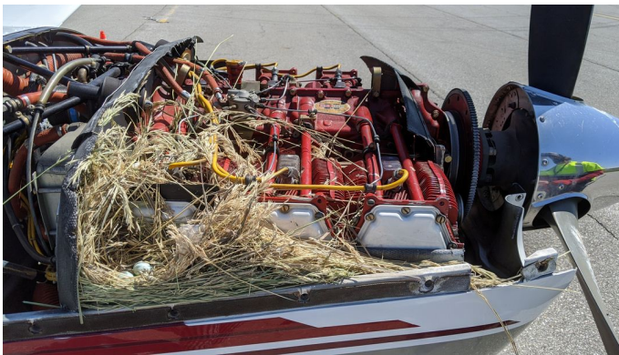
ENGINE PLUGS PREVENT BIRD NEST FOD. Piper Saratoga Engine Cowling Bird's Nest

Engine Inlet Plugs are custom fit for your Piper Pawnee PA-25 intakes, made with heavy-duty vinyl material, and stuffed with a single block of sculpted urethane foam. Each plug has a zipper that allows the foam to be removed and dried if necessary. Engine plugs have warning flags that are visible from the cockpit or 'remove before flight' streamers sewn onto the face of the plugs. Most plugs are imprinted with the aircraft registration number in black for an extra charge. Storage bag NOT included. Engine plugs may be inserted after flight when the engine is still warm. Engine Inlet Plugs are commonly referred to as Cowl Plugs, Intake Plugs, Cowl Blocks, Engine Blocks, and Engine Bungs.