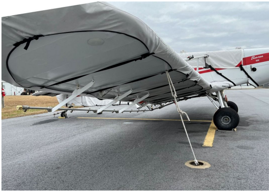
Piper PA-25 Pawnee Cover Set