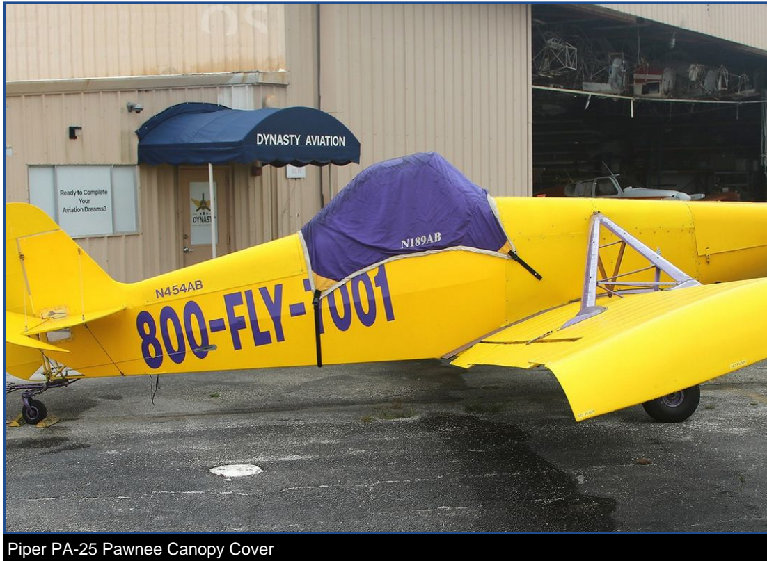
Piper PA-25 Pawnee Canopy Cover