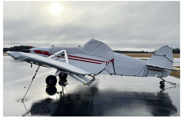
Piper Pawnee Canopy/Hopper, Wing & Empennage Covers