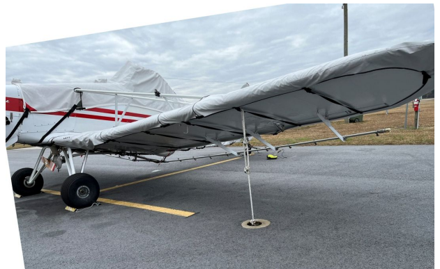
Piper PA-25 Pawnee Cover Set