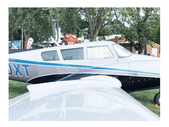
Piper PA-30 Twin Comanche Cockpit HeatShields