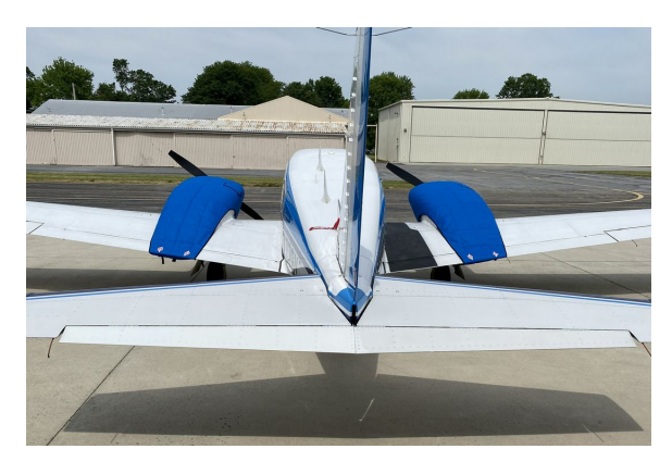
Piper PA-30 Twin Comanche Insulated Engine Covers