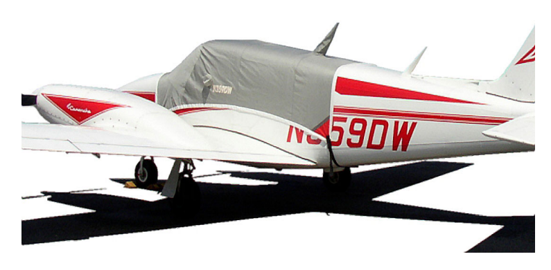
Piper Twin Comanche Canopy Cover