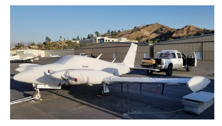
Piper Twin Comanche Canopy Cover, Wing & Engine Covers with Tip Tanks