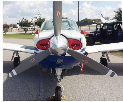
Piper PA-32 Engine Inlet Plugs