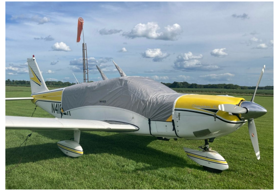
Piper PA-32-301T Travel Weight Canopy Cover, w/fwd bib.