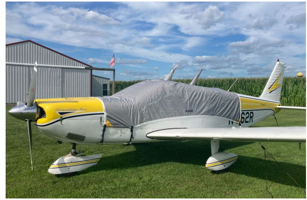
Piper PA-32-301T Travel Weight Canopy Cover, w/fwd bib.