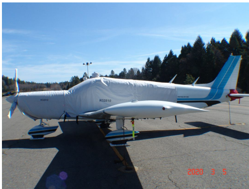
Piper PA-32-300 Extended Canopy, Engine, Prop & Tailcone Covers

WINTER USE MATERIAL - Made with Solution-Dyed Polyester fabric, this option is intended for seasonal use to aid in deicing, rain mitigation, or for occasional travel. The material is lighter and more compact, but more susceptible to UV damage and may have a shorter useful life if used continuously outside than the all-year use material.