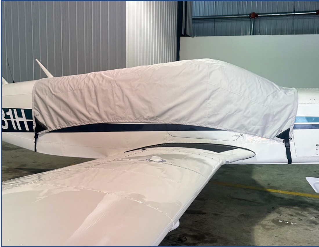
Piper PA-32 Saratoga, Cherokee 6, Lance Canopy Cover