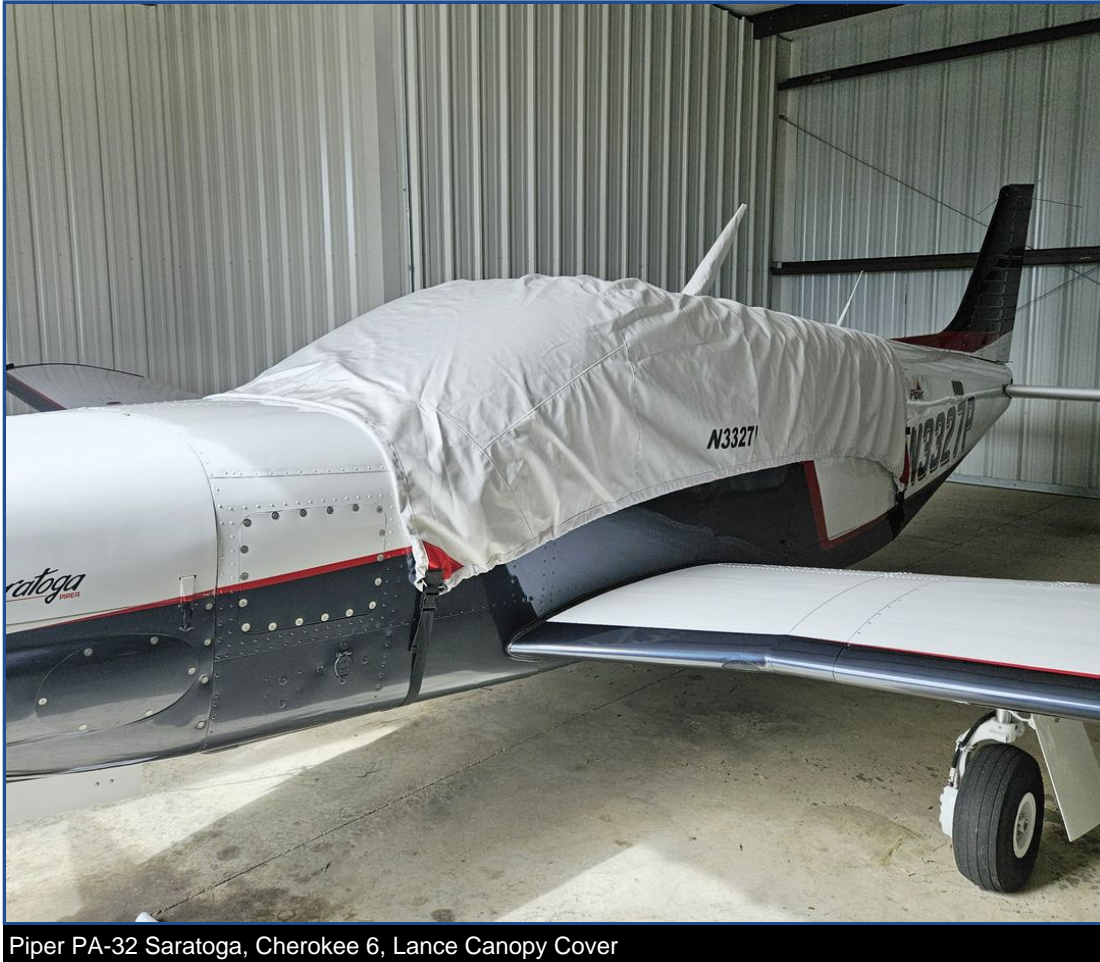
Piper PA-32 Saratoga, Cherokee 6, Lance Canopy Cover