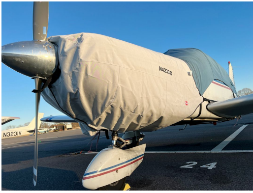
Piper PA-32-300 Fully Enclosed Engine Cover