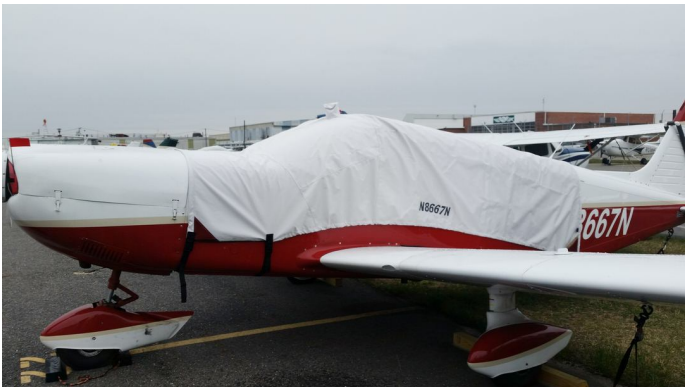
Piper PA-32R-301 Extended Canopy Cover, Wing Covers