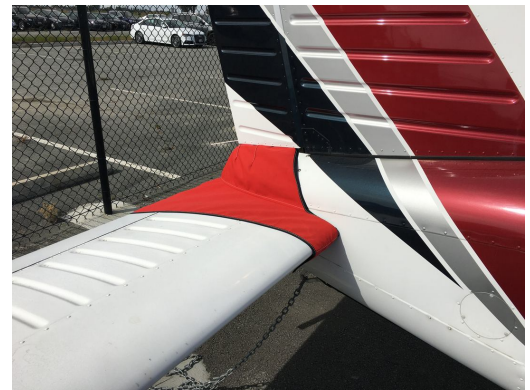
Piper PA-32 Models Tailcone Cover, Fully Enclosed