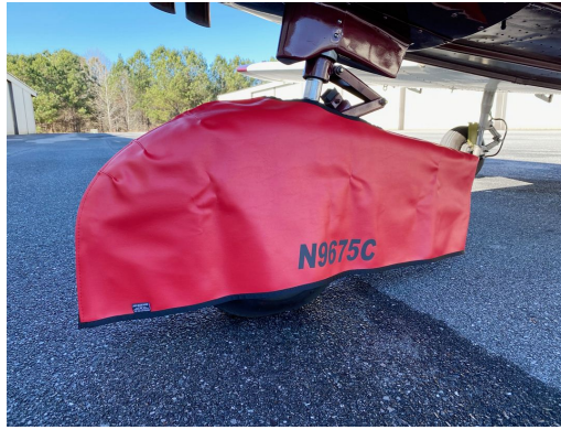
Piper PA-32 Saratoga Front Wheelpant Cover

protection and cover longevity. This heavier more durable material is intended for all weather conditions, such as rain and snow or lots of sun.