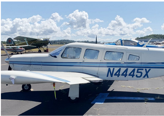
Piper PA32-300 HeatShield Set

Windshield Heatshields are interior sunshades for an aircraft's front windshield. The product is a unique composite of closed-cell foam with a silver mylar finish. The semi-rigid design is stiff enough to stand along the inside of the windshield using sun visors or window framing. It folds up flat and easily stores in the included storage sleeve. Some designs may require velcro and suction cups or split right and left sides. A Heatshield is an excellent short-term remedy for cockpit overheating. An external fabric cover is far more effective and practical for long-term protection.