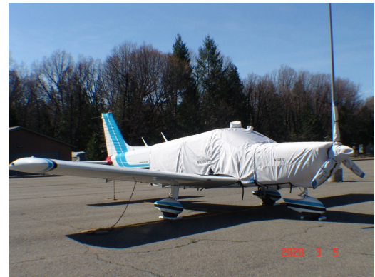
Piper PA-32-300 Extended Canopy, Engine, Prop & Tailcone Covers