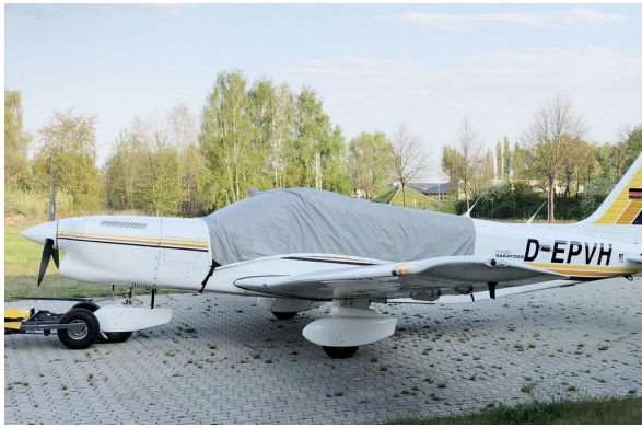
Piper PA-32 Saratoga Travel Weight Canopy Cover