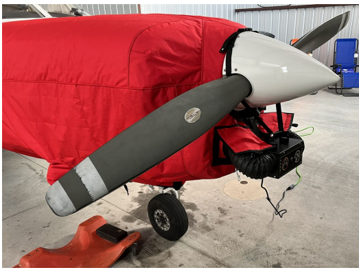
Piper PA-32RT-300T Insulated Engine Cover