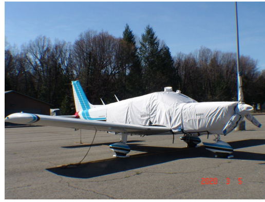
Piper PA32-300 Extended Canopy, Engine & Prop Covers