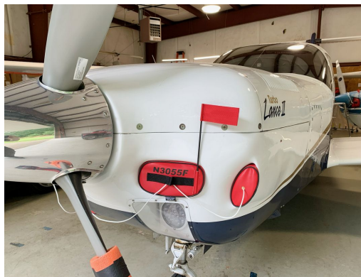
Piper Lance II Engine Inlet Plugs