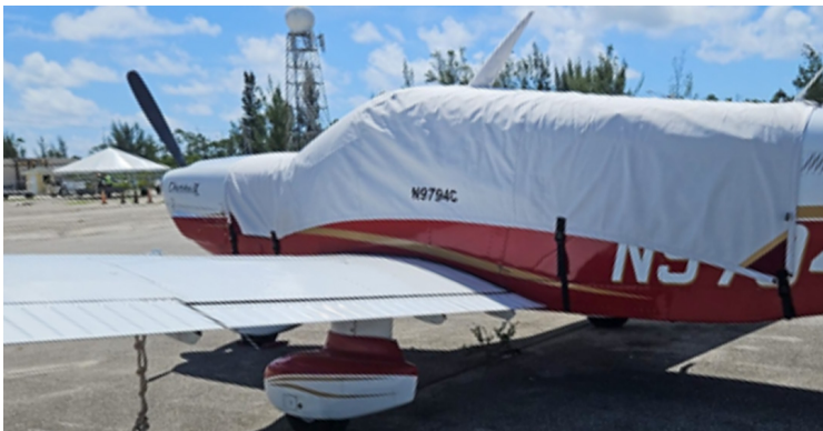
Piper PA-32 Saratoga Canopy Cover W/fwd Bib To Cover Baggage Door

This cover type is made from Silver Acrylic Sunbrella canvas and is 100% lined with a soft and smooth microfiber. Bruce's Custom Covers developed this material combination especially for aircraft protection. The outer material is medium weight and treated for water resistance, UV resistance and anti-static buildup. The inner lining is a very soft and smooth microfiber to prevent scratching. The material is very reflective, and tests show that the cabin interior temperature can be reduced to near-ambient temperature on the hottest of days. It is water, ice and snow repellent, yet breathable to allow moisture to escape from between the cover and the aircraft surface.