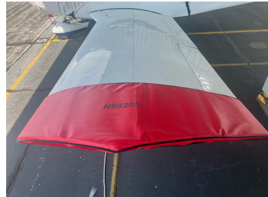
Piper PA-28-140 Wingtip Pads