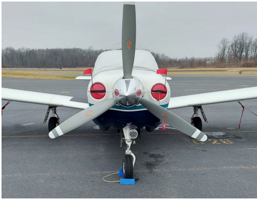
Piper PA-32R-301 Engine Plugs