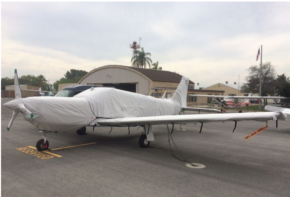
Piper Saratoga Cover Set