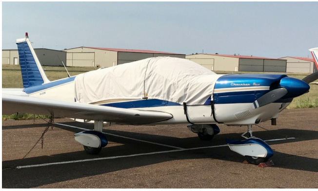
Piper Cherokee Six Canopy Cover with forward bib to cover baggage door.