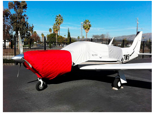
Piper PA-32 Insulated Engine Cover