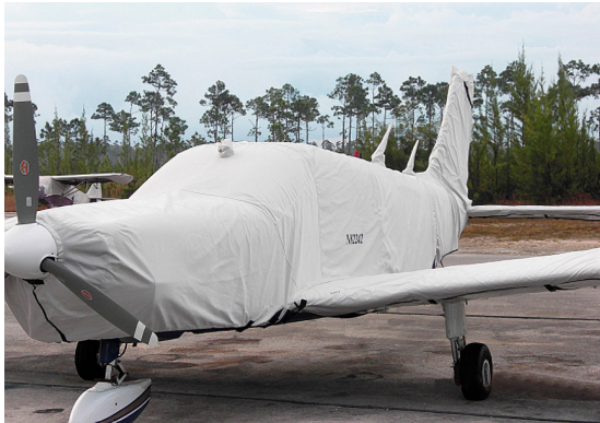
Piper PA-32 Extended Canopy/Engine Cover (extends to dorsal), Empennage Cover, and Wing Covers

This cover type is made from Silver Acrylic Sunbrella canvas and is 100% lined with a soft and smooth microfiber. Bruce's Custom Covers developed this material combination especially for aircraft protection. The outer material is medium weight and treated for water resistance, UV resistance and anti-static buildup. The inner lining is a very soft and smooth microfiber to prevent scratching. The material is very reflective, and tests show that the cabin interior temperature can be reduced to near-ambient temperature on the hottest of days. It is water, ice and snow repellent, yet breathable to allow moisture to escape from between the cover and the aircraft surface.