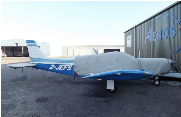
Piper PA-32R-301T Extended Canopy, Engine, Horiz. Stabilizer Covers

WINTER USE MATERIAL - Made with Solution-Dyed Polyester fabric, this option is intended for seasonal use to aid in deicing, rain mitigation, or for occasional travel. The material is lighter and more compact, but more susceptible to UV damage and may have a shorter useful life if used continuously outside than the all-year use material.