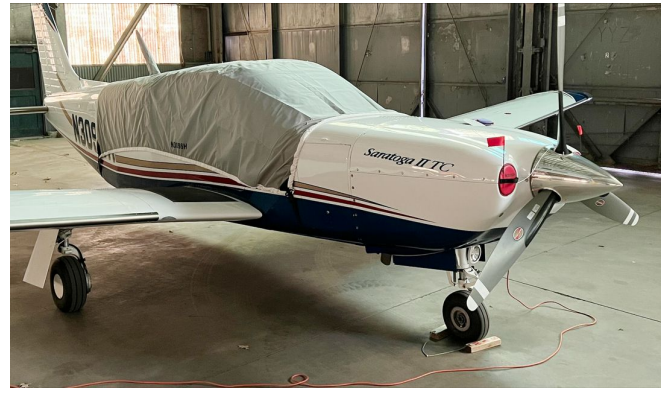
Piper Saratoga PA-32R-301T Travel Canopy Cover, Intake Plugs