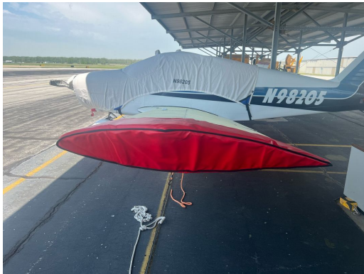
Piper PA-28-140 Wingtip Pads

Designed to prevent damage to the aircraft extremities in crowded hangars, these products are made of bright red Naugahyde and thickly padded with a sandwich of closed cell foam.