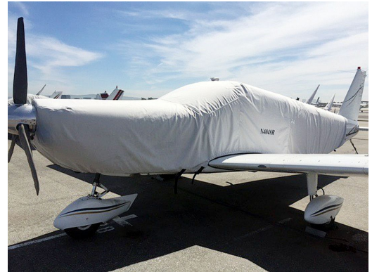
Piper PA-32 Fuselage Cover (Canopy/Engine Cover, Extends to Dorsal)