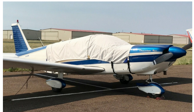
Piper Cherokee Six Canopy Cover with forward bib to cover baggage door.