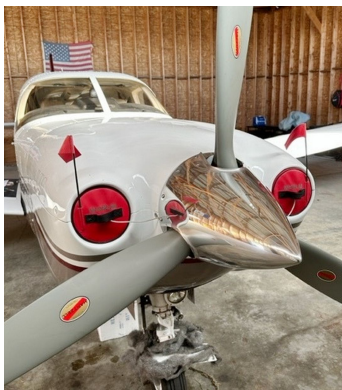
Piper PA-32 Saratoga Engine Inlet Plugs