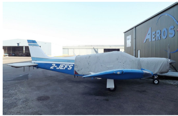
Piper PA-32R-301T Extended Canopy, Engine, Horiz. Stabilizer Covers