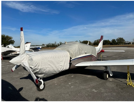
Piper PA-32 Engine & Prop Covers