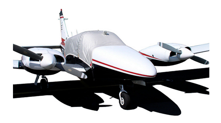
Piper Seneca Canopy Cover