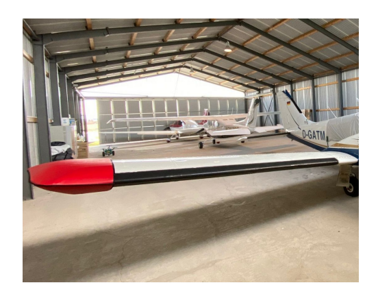
Piper PA-34 Seneca Wingtip Protectors

Designed to prevent damage to the aircraft extremities in crowded hangars, these products are made of bright red Naugahyde and thickly padded with a sandwich of closed cell foam.