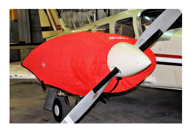
Piper Seneca Insulated Engine Covers

Covers developed this material combination especially for aircraft protection. The outer material is medium weight and treated for water resistance, UV resistance and anti-static buildup. The inner lining is a very soft and smooth microfiber to prevent scratching. The material is very reflective, and tests show that the cabin interior temperature can be reduced to near-ambient temperature on the hottest of days. It is water, ice and snow repellent, yet breathable to allow moisture to escape from between the cover and the aircraft surface.