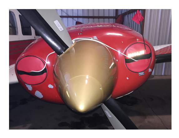
Piper PA-34 Seneca Engine Inlet Plugs (Lopresti Cowling)