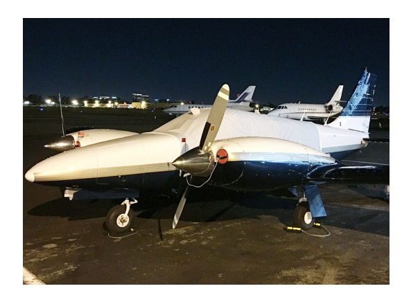
Piper PA-34 Seneca Canopy Cover and Inlet Plugs