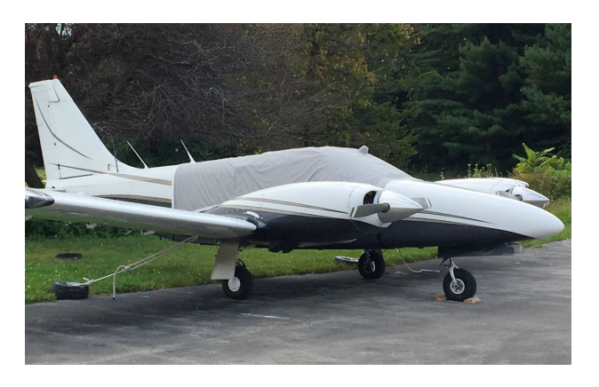
Piper Seneca Light Weight Travel Canopy Cover