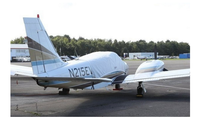
Piper Seneca Canopy Cover