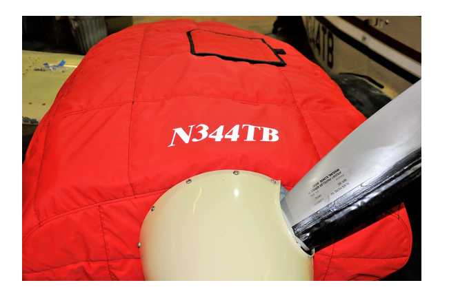
Piper Seneca Insulated Engine Covers