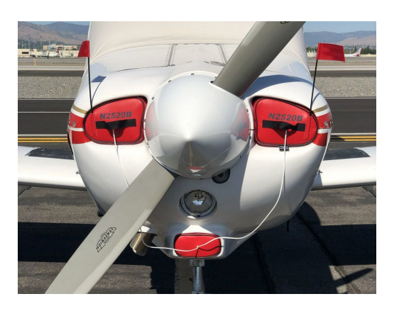
Piper Tomahawk Engine Inlet Plugs, set of 3