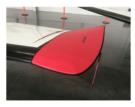
Piper Meridian Wingtip Pads, M600 Models