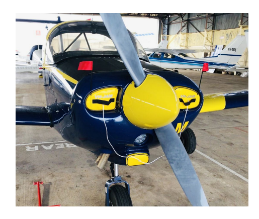
Piper PA-38 Tomahawk Engine Inlet Plugs with custom color