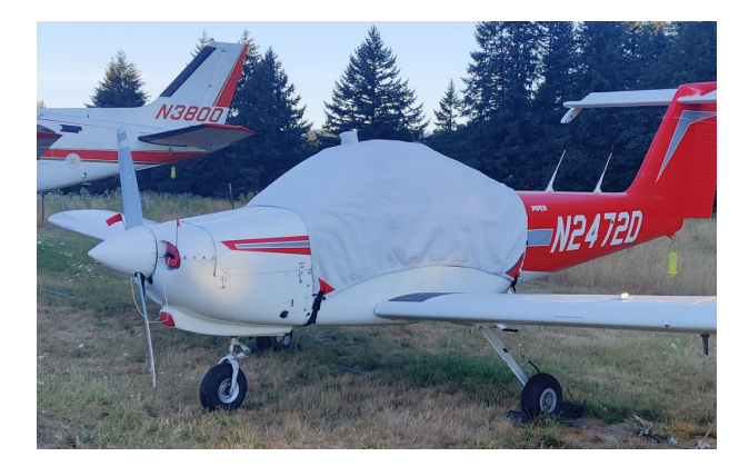
Piper PA-38 Tomahawk Canopy Cover