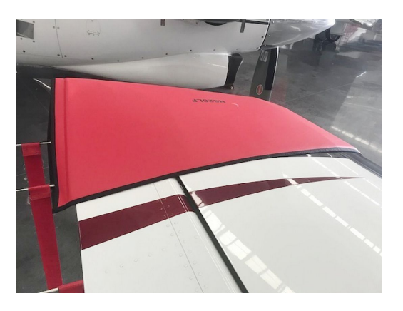
Piper Meridian Wingtip Pads, M600 Models