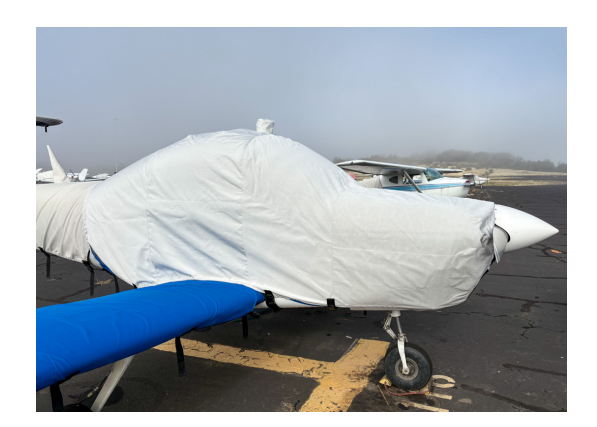
Piper PA-38 Tomahawk Extended Canopy/Engine Cover

This cover type is made from Silver Acrylic Sunbrella canvas and is 100% lined with a soft and smooth microfiber. Bruce's Custom Covers developed this material combination especially for aircraft protection. The outer material is medium weight and treated for water resistance, UV resistance and anti-static buildup. The inner lining is a very soft and smooth microfiber to prevent scratching. The material is very reflective, and tests show that the cabin interior temperature can be reduced to near-ambient temperature on the hottest of days. It is water, ice and snow repellent, yet breathable to allow moisture to escape from between the cover and the aircraft surface.