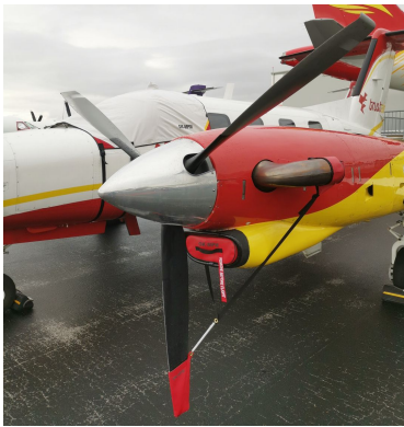
Piper PA-42 Cheyenne III Prop Tie/Exhaust Cover, Inlet Plugs

This cover type is made from Silver Acrylic Sunbrella canvas and is 100% lined with a soft and smooth microfiber. Bruce's Custom Covers developed this material combination especially for aircraft protection. The outer material is medium weight and treated for water resistance, UV resistance and anti-static buildup. The inner lining is a very soft and smooth microfiber to prevent scratching. The material is very reflective, and tests show that the cabin interior temperature can be reduced to near-ambient temperature on the hottest of days. It is water, ice and snow repellent, yet breathable to allow moisture to escape from between the cover and the aircraft surface.