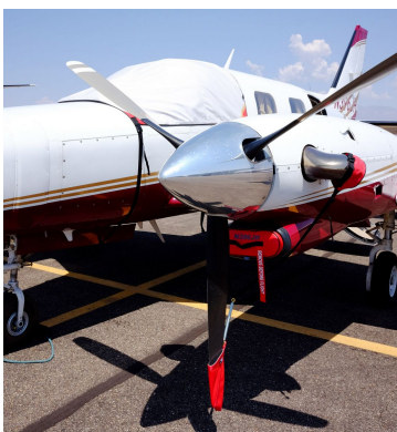
Piper Cheyenne Cockpit Cover, Engine Plugs, Prop Tie/Exhaust Covers

This cover type is made from Silver Acrylic Sunbrella canvas and is 100% lined with a soft and smooth microfiber. Bruce's Custom Covers developed this material combination especially for aircraft protection. The outer material is medium weight and treated for water resistance, UV resistance and anti-static buildup. The inner lining is a very soft and smooth microfiber to prevent scratching. The material is very reflective, and tests show that the cabin interior temperature can be reduced to near-ambient temperature on the hottest of days. It is water, ice and snow repellent, yet breathable to allow moisture to escape from between the cover and the aircraft surface.