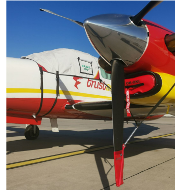
Piper PA-42 Cheyenne III Engine Plugs, Prop Ties, Cockpit Cover