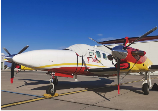
Piper PA-42 Cheyenne III Engine Plugs, Prop Ties, Cockpit Cover

Engine Inlet Plugs are custom fit for your Piper PA-42 Cheyenne III intakes, made with heavy-duty vinyl material, and stuffed with a single block of sculpted urethane foam. Each plug has a zipper that allows the foam to be removed and dried if necessary. Engine plugs have warning flags that are visible from the cockpit or 'remove before flight' streamers sewn onto the face of the plugs. Most plugs are imprinted with the aircraft registration number in black for an extra charge. Storage bag NOT included. Engine plugs may be inserted after flight when the engine is still warm. Engine Inlet Plugs are commonly referred to as Cowl Plugs, Intake Plugs, Cowl Blocks, Engine Blocks, and Engine Bungs.