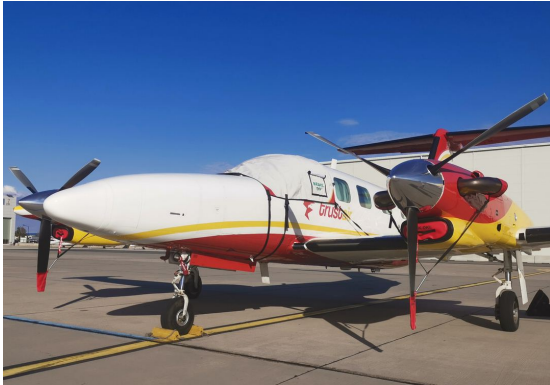
Piper PA-42 Cheyenne III Engine Plugs, Prop Ties, Cockpit Cover

Engine Inlet Plugs are custom fit for your Piper PA-42 Cheyenne III intakes, made with heavy-duty vinyl material, and stuffed with a single block of sculpted urethane foam. Each plug has a zipper that allows the foam to be removed and dried if necessary. Engine plugs have warning flags that are visible from the cockpit or 'remove before flight' streamers sewn onto the face of the plugs. Most plugs are imprinted with the aircraft registration number in black for an extra charge. Storage bag NOT included. Engine plugs may be inserted after flight when the engine is still warm. Engine Inlet Plugs are commonly referred to as Cowl Plugs, Intake Plugs, Cowl Blocks, Engine Blocks, and Engine Bungs.