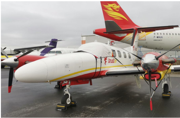
Piper PA-42 Cheyenne III Cockpit Cover, Prop Tie/Exhaust Cover, Inlet Plugs

This cover type is made from Silver Acrylic Sunbrella canvas and is 100% lined with a soft and smooth microfiber. Bruce's Custom Covers developed this material combination especially for aircraft protection. The outer material is medium weight and treated for water resistance, UV resistance and anti-static buildup. The inner lining is a very soft and smooth microfiber to prevent scratching. The material is very reflective, and tests show that the cabin interior temperature can be reduced to near-ambient temperature on the hottest of days. It is water, ice and snow repellent, yet breathable to allow moisture to escape from between the cover and the aircraft surface.