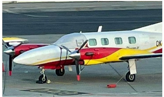
Piper PA-42 Cheyenne III Cockpit Cover