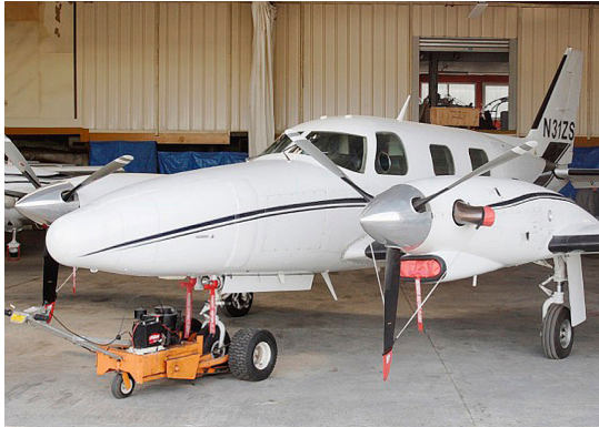
Piper Cheyenne IIXL Prop Tie/Exhaust Covers, Intake Plugs

Engine Inlet Plugs are custom fit for your Piper PA-42 Cheyenne III intakes, made with heavy-duty vinyl material, and stuffed with a single block of sculpted urethane foam. Each plug has a zipper that allows the foam to be removed and dried if necessary. Engine plugs have warning flags that are visible from the cockpit or 'remove before flight' streamers sewn onto the face of the plugs. Most plugs are imprinted with the aircraft registration number in black for an extra charge. Storage bag NOT included. Engine plugs may be inserted after flight when the engine is still warm. Engine Inlet Plugs are commonly referred to as Cowl Plugs, Intake Plugs, Cowl Blocks, Engine Blocks, and Engine Bungs.