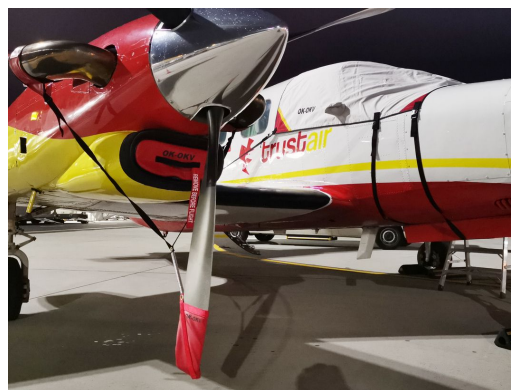
Piper PA-42 Cheyenne III Cockpit Cover, Prop Tie/Exhaust Cover, Inlet Plugs