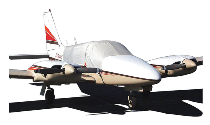
Piper Seneca PA-34 Canopy Cover

Travel Covers are made with Silver Solution-Dyed Polyester fabric and only lined over the windshield to save weight. The material is lightweight and more compact for easy stowage in the aircraft. The polyester material is water resistant, but only intended for occasional use outside. We also have an ultra lightweight material available for fitted hangar dust covers. For daily outdoor use, the non-travel Sunbrella Cover is the best choice.