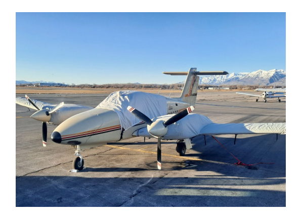
Piper PA-44 Wing/Engine Covers, Canopy Cover

WINTER USE MATERIAL - Made with Solution-Dyed Polyester fabric, this option is intended for seasonal use to aid in deicing, rain mitigation, or for occasional travel. The material is lighter and more compact, but more susceptible to UV damage and may have a shorter useful life if used continuously outside than the all-year use material.