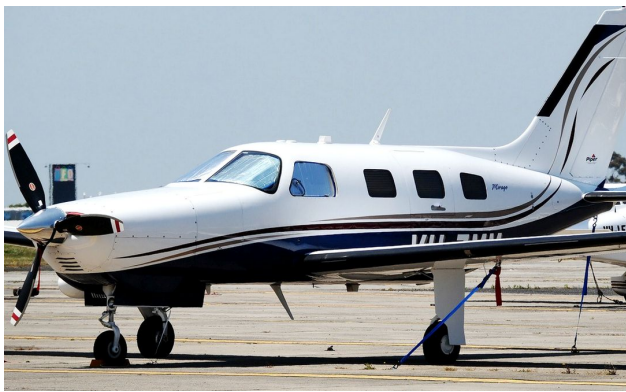
Piper PA-46-350P Mirage, Matrix, JetProp Cockpit Heatshields