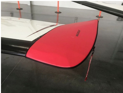
Piper Meridian Wingtip Pads, M600 Models

Designed to prevent damage to the aircraft extremities in crowded hangars, these products are made of bright red Naugahyde and thickly padded with a sandwich of closed cell foam.