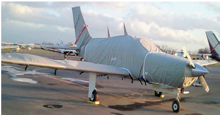
Piper PA-46 Malibu Complete Cover Set