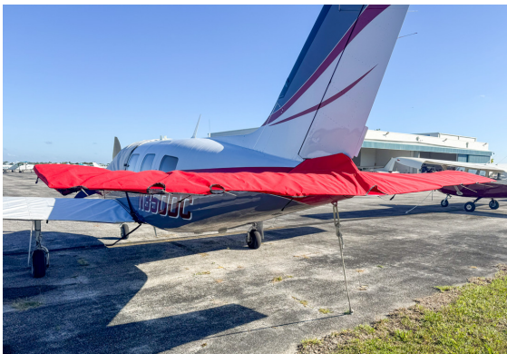
Piper PA 46-350P Horizontal Stabilizer/Tailcone Cover

WINTER USE MATERIAL - Made with Solution-Dyed Polyester fabric, this option is intended for seasonal use to aid in deicing, rain mitigation, or for occasional travel. The material is lighter and more compact, but more susceptible to UV damage and may have a shorter useful life if used continuously outside than the all-year use material.