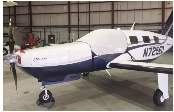
Piper Malibu/Mirage Cockpit Cover, Engine Plugs