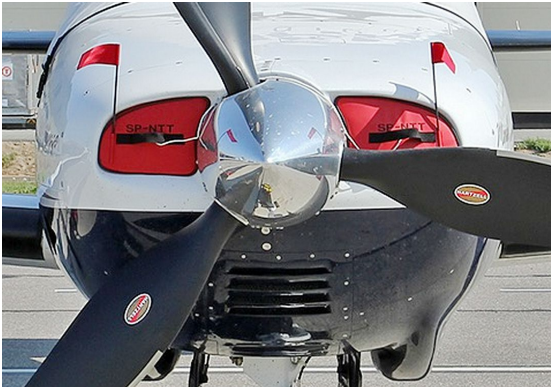
Piper PA-46-350P Mirage Engine Inlet Plugs