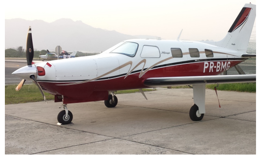
Piper Malibu/Mirage Engine Plugs, Cockpit HeatShields