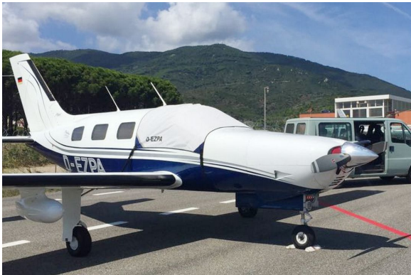
Piper Mirage PA-46-35OP Cockpit Cover