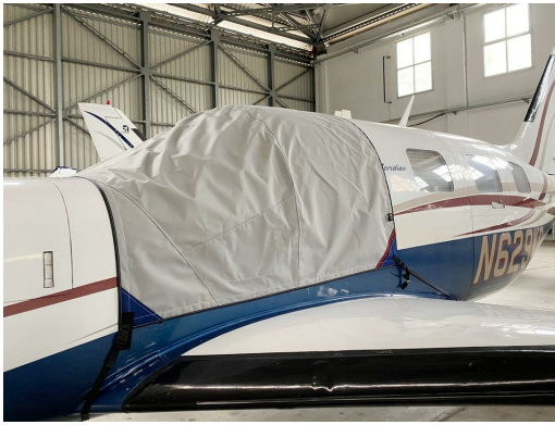
Piper PA-46-500TP Travel Cover Cockpit Cover