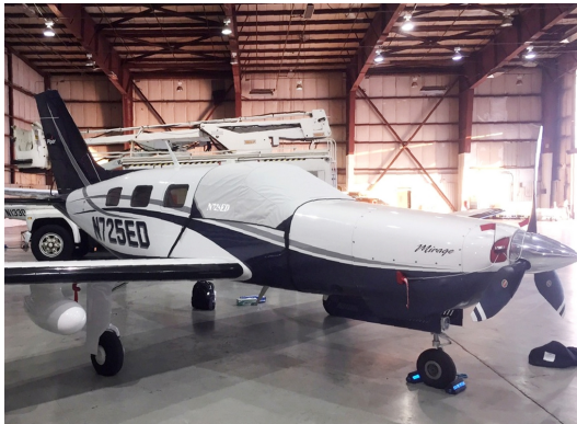
Piper Malibu/Mirage Cockpit Cover, Engine Plugs

This cover type is made from Silver Acrylic Sunbrella canvas and is 100% lined with a soft and smooth microfiber. Bruce's Custom Covers developed this material combination especially for aircraft protection. The outer material is medium weight and treated for water resistance, UV resistance and anti-static buildup. The inner lining is a very soft and smooth microfiber to prevent scratching. The material is very reflective, and tests show that the cabin interior temperature can be reduced to near-ambient temperature on the hottest of days. It is water, ice and snow repellent, yet breathable to allow moisture to escape from between the cover and the aircraft surface.