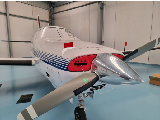
Piper PA-46 Malibu Engine Inlet Plugs

Engine Inlet Plugs are custom fit for your Piper PA-46 Malibu intakes, made with heavy-duty vinyl material, and stuffed with a single block of sculpted urethane foam. Each plug has a zipper that allows the foam to be removed and dried if necessary. Engine plugs have warning flags that are visible from the cockpit or 'remove before flight' streamers sewn onto the face of the plugs. Most plugs are imprinted with the aircraft registration number in black for an extra charge. Storage bag NOT included. Engine plugs may be inserted after flight when the engine is still warm. Engine Inlet Plugs are commonly referred to as Cowl Plugs, Intake Plugs, Cowl Blocks, Engine Blocks, and Engine Bungs.