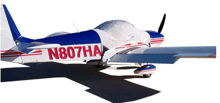
Pazmany PL2 Homebuilt Canopy Cover