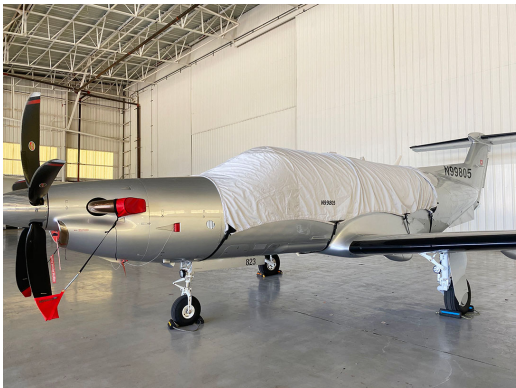
Pilatus PC-12, U-28A, NGX Cockpit Cover, Snap-On Type

This cover type is made from Silver Acrylic Sunbrella canvas and is 100% lined with a soft and smooth microfiber. Bruce's Custom Covers developed this material combination especially for aircraft protection. The outer material is medium weight and treated for water resistance, UV resistance and anti-static buildup. The inner lining is a very soft and smooth microfiber to prevent scratching. The material is very reflective, and tests show that the cabin interior temperature can be reduced to near-ambient temperature on the hottest of days. It is water, ice and snow repellent, yet breathable to allow moisture to escape from between the cover and the aircraft surface.