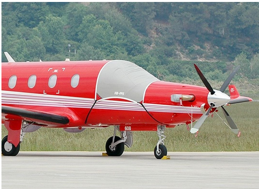
Pilatus PC-12 Windshield Cover

This cover type is made from Silver Acrylic Sunbrella canvas and is 100% lined with a soft and smooth microfiber. Bruce's Custom Covers developed this material combination especially for aircraft protection. The outer material is medium weight and treated for water resistance, UV resistance and anti-static buildup. The inner lining is a very soft and smooth microfiber to prevent scratching. The material is very reflective, and tests show that the cabin interior temperature can be reduced to near-ambient temperature on the hottest of days. It is water, ice and snow repellent, yet breathable to allow moisture to escape from between the cover and the aircraft surface.