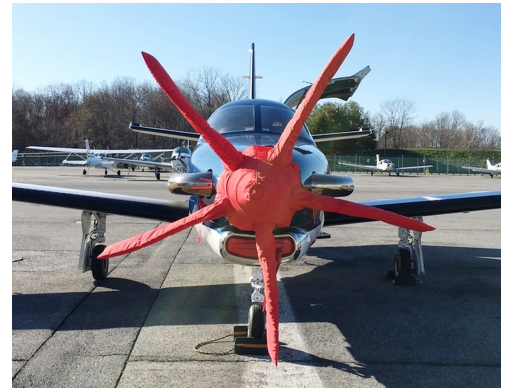
Prop Tie-Down, Various Models (secures with a hook to engine nacelle)