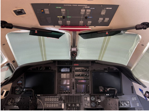
Pilatus PC-12 Cockpit HeatShields

Cockpit Heatshields are interior sunshades for the aircraft's cockpit. The product is a unique composite of closed-cell foam with a silver mylar finish. The semi-rigid design is stiff enough to stand inside the window framing. The set folds up flat and is easily stored in the included storage sleeve. Some designs may require velcro and suction cups. A Heatshield is an excellent short-term remedy for cockpit overheating, but an external fabric cover is more effective for long-term protection.