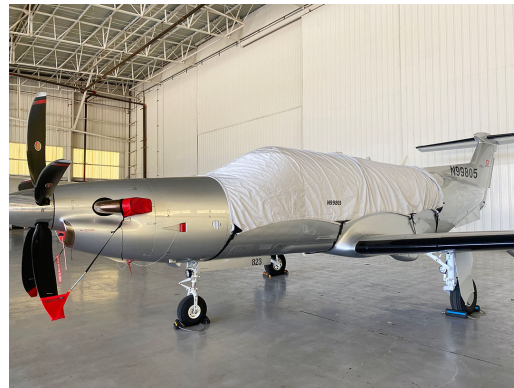
Pilatus PC-12, U-28A, NGX Cockpit Cover, Snap-On Type