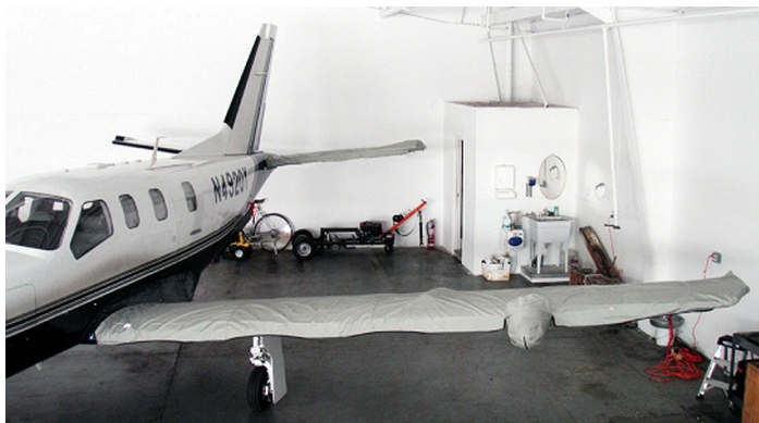
Pilatus PC-12 Wing Covers

WINTER USE MATERIAL - Made with Solution-Dyed Polyester fabric, this option is intended for seasonal use to aid in deicing, rain mitigation, or for occasional travel. The material is lighter and more compact, but more susceptible to UV damage and may have a shorter useful life if used continuously outside than the all-year use material.