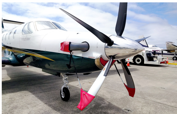
Main Intake Plug and Prop-Tie/Exhaust Covers. (Sold Separately)