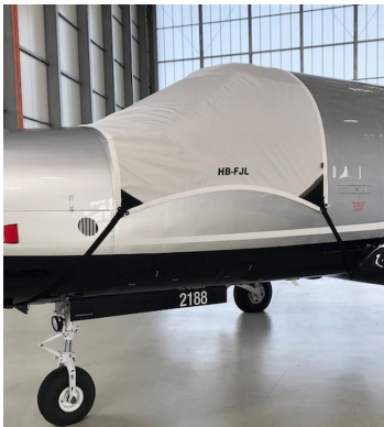
Pilatus PC-12 Cockpit Cover

This cover type is made from Silver Acrylic Sunbrella canvas and is 100% lined with a soft and smooth microfiber. Bruce's Custom Covers developed this material combination especially for aircraft protection. The outer material is medium weight and treated for water resistance, UV resistance and anti-static buildup. The inner lining is a very soft and smooth microfiber to prevent scratching. The material is very reflective, and tests show that the cabin interior temperature can be reduced to near-ambient temperature on the hottest of days. It is water, ice and snow repellent, yet breathable to allow moisture to escape from between the cover and the aircraft surface.