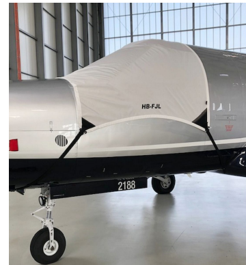
Pilatus PC-12 Cockpit Cover