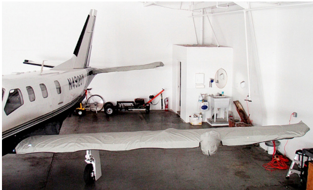
Socata TBM 700, 850 Wing and Horizontal Stabilizer Covers

WINTER USE MATERIAL - Made with Solution-Dyed Polyester fabric, this option is intended for seasonal use to aid in deicing, rain mitigation, or for occasional travel. The material is lighter and more compact, but more susceptible to UV damage and may have a shorter useful life if used continuously outside than the all-year use material.