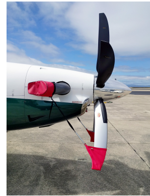
Pilatus PC-12 Prop Tie-Down/Exhaust Cover Set, 5 Blade