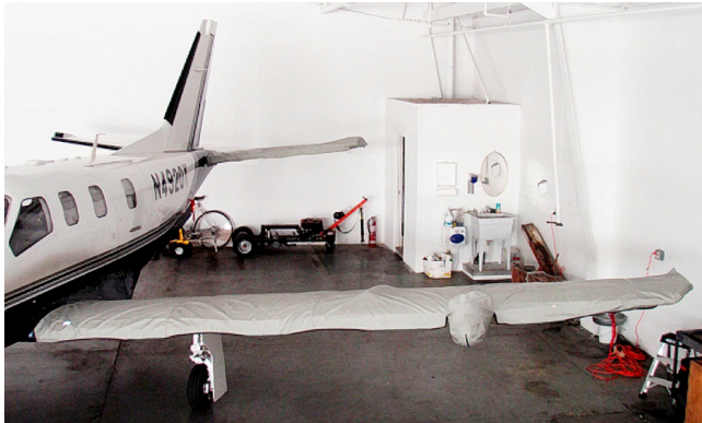
Socata TBM 700, 850 Wing and Horizontal Stabilizer Covers