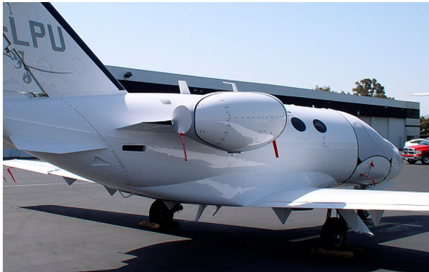
Citation Mustang Light Weight Engine Cover, Light Weight Windshield Cover, Pitot/AOA Cover

The Pilatus PC-24 Intake/Exhaust Plugs are custom fit for the intake and exhaust openings, made with heavy-duty vinyl material, and stuffed with a single block of sculpted urethane foam. Each plug has a zipper that allows the foam to be removed and dried if necessary. Engine plugs have 'remove before flight' streamers sewn onto the face of the plugs. Most plugs are imprinted with the aircraft registration number in black. Engine plugs may be inserted after flight when the engine is still warm. Engine Inlet Plugs are commonly referred to as Cowl Plugs, Intake Plugs, Cowl Blocks, Engine Blocks, and Engine Bungs.