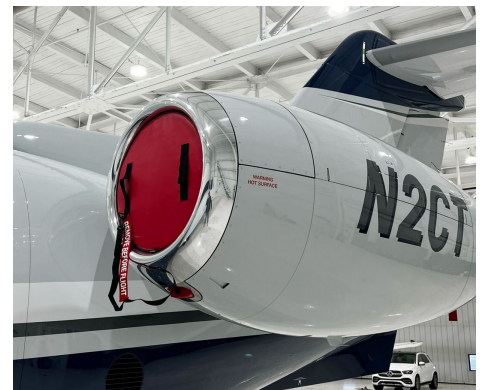
Pilatus PC-24 Engine Inlet Plugs