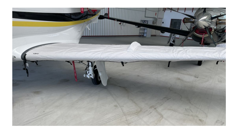
Embraer Phenom 100 Canopy/Nose Cover