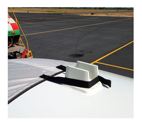
Phenom 100 EMB-500 Cockpit Cover (includes straps to hook around traffic antennae so the cover will not slip forward)