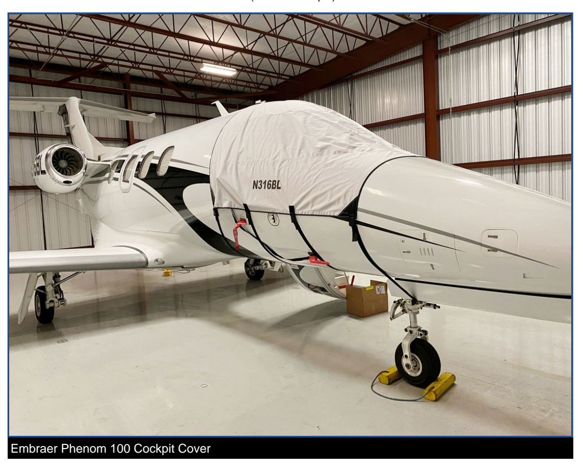
Section 1: Canopy/Cockpit/Fuselage Covers

Canopy Covers help reduce damage to your airplane's upholstery and avionics caused by excessive heat, and they can eliminate problems caused by leaking door and window seals. They keep the windshield and window surfaces clean and help prevent vandalism and theft.