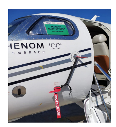
Phenom 100 (EMB 500) Pitot Cover/AOA Set

The Engine Inlet Plugs are custom fit for your Embraer Phenom 100 (EMB-500) intakes, made with heavy-duty vinyl material, and stuffed with a single block of sculpted urethane foam. Each plug has a zipper that allows the foam to be removed and dried if necessary. Engine plugs have 'remove before flight' streamers sewn onto the face of the plugs. Most plugs are imprinted with the aircraft registration number in black for an extra charge. Storage bag NOT included. Engine plugs may be inserted after flight when the engine is still warm. Engine Inlet Plugs are commonly referred to as Cowl Plugs, Intake Plugs, Cowl Blocks, Engine Blocks, and Engine Bungs.