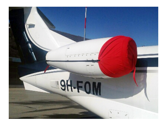
Embraer Phenom Engine Intake Covers & Exhaust Plugs