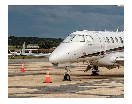
Embraer Phenom 100 Cockpit HeatShields

Cockpit Heatshields are interior sunshades for the aircraft's cockpit. The product is a unique composite of closed-cell foam with a silver mylar finish. The semi-rigid design is stiff enough to stand inside the window framing. The set folds up flat and is easily stored in the included storage sleeve. Some designs may require velcro and suction cups. Our Heatshields for jets are offered white side out because some aircraft manufacturers have issued advisories against reflective window inserts due to potential heat damage. A Heatshield is an excellent short-term remedy for cockpit overheating, but an external fabric cover is more effective for long-term protection.