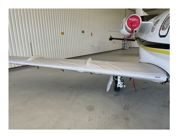
Embraer Phenom 100 Canopy/Nose Cover