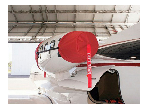
Phenom 100 Tri-fold style Engine Cover Set

Engine Inlet Plugs are commonly referred to as Cowl Plugs, Intake Plugs, Cowl Blocks, Engine Blocks, and Engine Bungs.