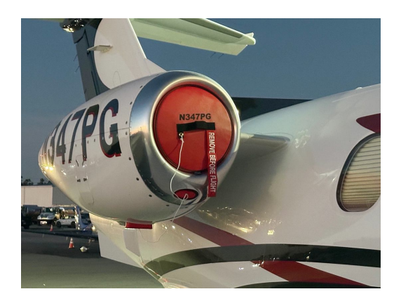
Embraer Phenom 100 Intake & Exhaust Plugs